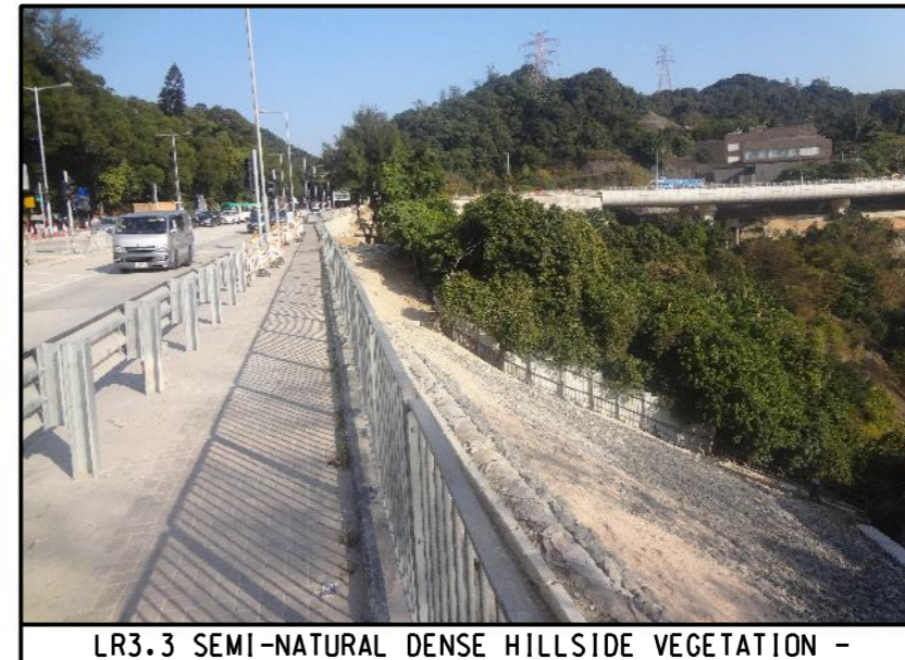
LR3.3 SEMI-NATURAL DENSE HILLSIDE VEGETATION - VEGETATION AT SOUTH OF CLEAR WATER BAY ROAD AND AROUND NEW CLEAR WATER BAY ROAD