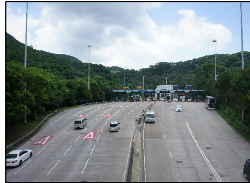
LR1.3 MAJOR TRANSPORT ROUTE - TSEUNG KWAN O ROAD