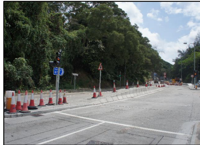
LR3.2 SEMI-NATURAL DENSE HILLSIDE VEGETATION - VEGETATION AT NORTH OF CLEAR WATER BAY ROAD