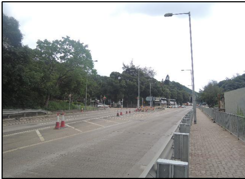
LR1.1 MAJOR TRANSPORT ROUTE - CLEAR WATER BAY ROAD