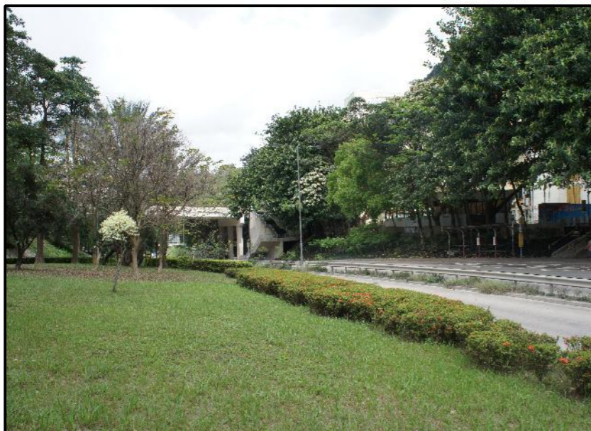
LR3.4 SEMI-NATURAL DENSE HILLSIDE VEGETATION - VEGETATION OF MERGING LANE NEXT TO SHUN LEE ESTATE