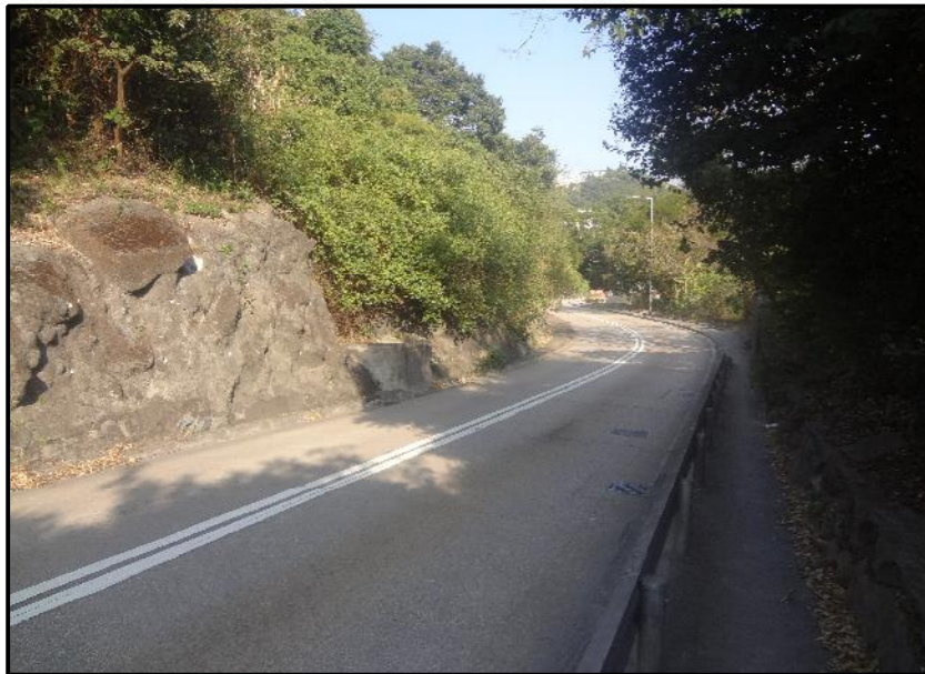
LR3.1 SEMI-NATURAL DENSE HILLSIDE VEGETATION - VEGETATION AROUND FEI NGO SHAN ROAD