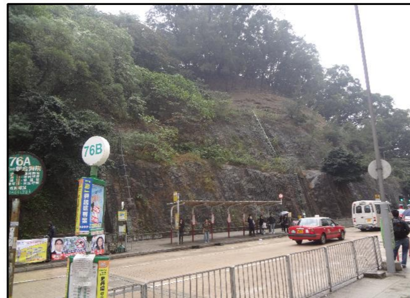
LR3.5 SEMI-NATURAL DENSE HILLSIDE VEGETATION - VEGETATION OF LAM TIN PARK