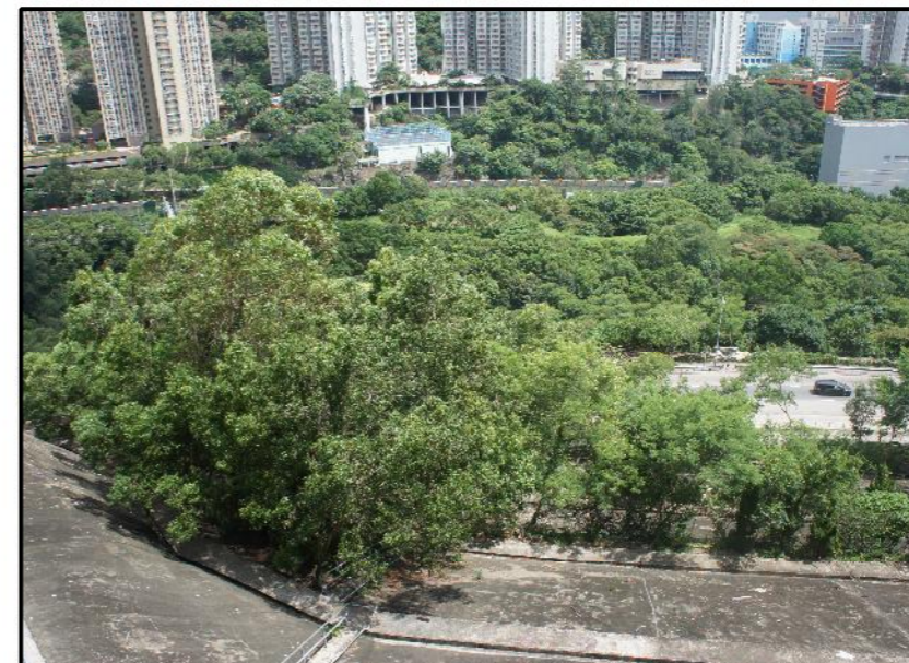
LR3.6 SEMI-NATURAL DENSE HILLSIDE VEGETATION - VEGETATION OF MA YAU TONG WEST SITTING OUT AREA