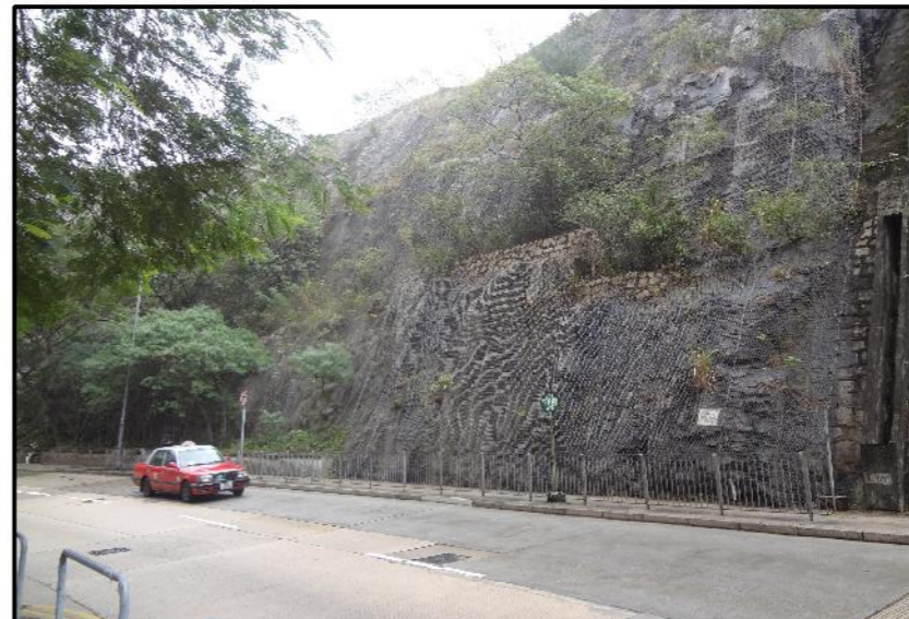
LR8.4 ENGINEERED SLOPE ALONG WITH SEMI-NATURAL DENSE HILLSIDE VEGETATION - ENGINEERED SLOPE ALONG LIN TAK ROAD