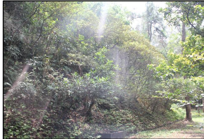
LR8.1 ENGINEERED SLOPE ALONG WITH SEMI-NATURAL DENSE HILLSIDE VEGETATION - ENGINEERED SLOPE ALONG CLEAR WATER BAY ROAD