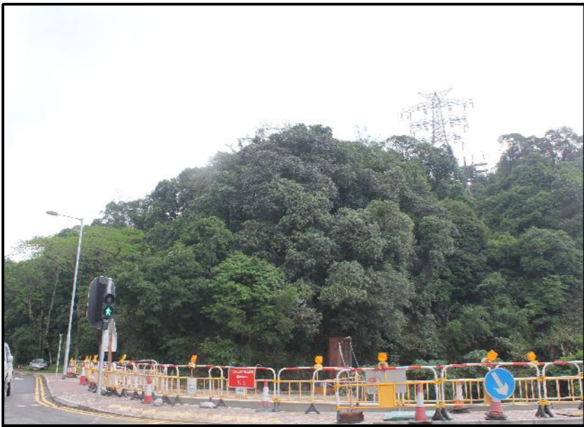
LR2 HILLSIDE WOODLAND