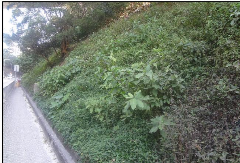
LR8.3 ENGINEERED SLOPE ALONG WITH SEMI-NATURAL DENSE HILLSIDE VEGETATION - ENGINEERED SLOPE ALONG SOUTH OF CLEAR WATER BAY ROAD