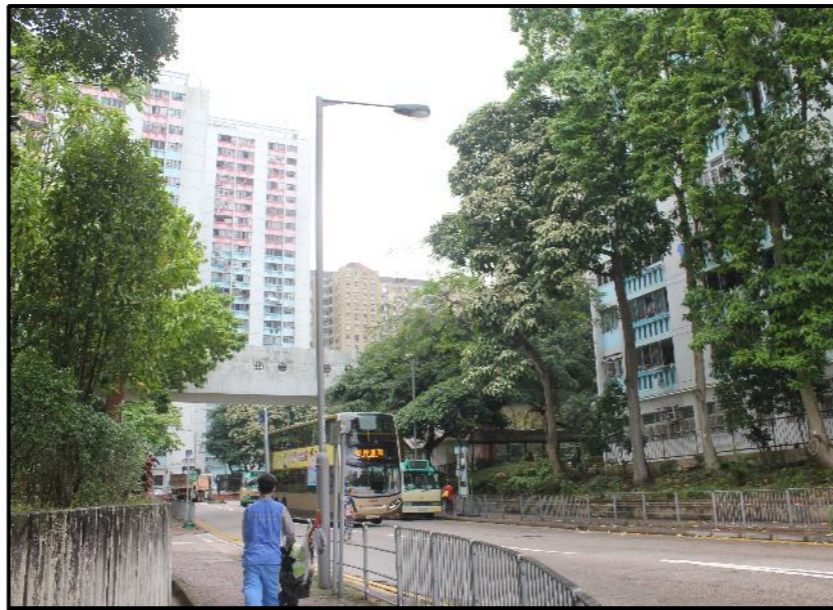
LR4 URBAN DEVELOPMENT AREA