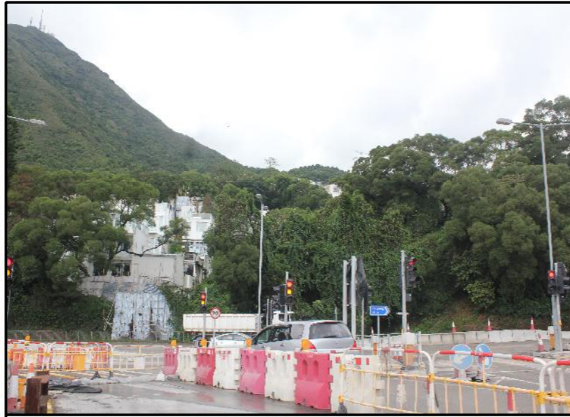
LR7 RURAL DEVELOPMENT AREA