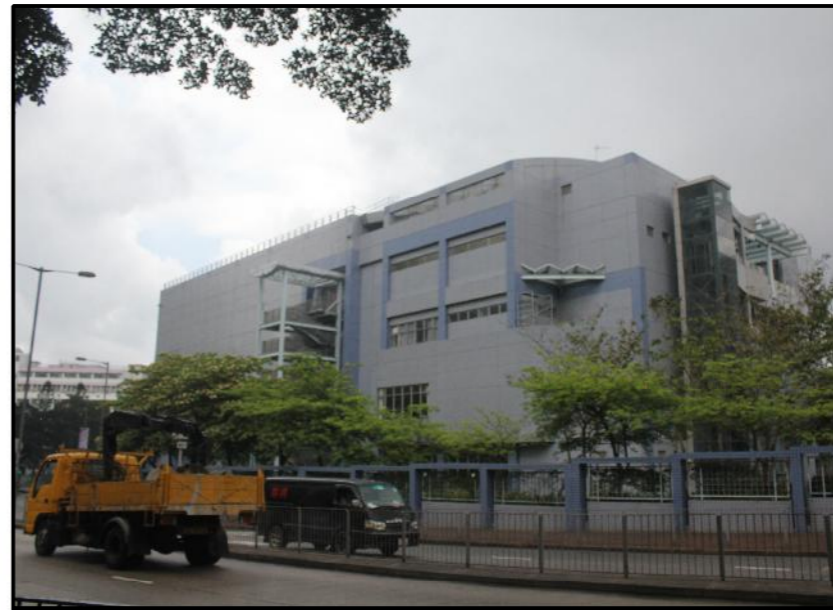
LR5 SHUN LEE TSUEN SPORTS CENTRE AND PARK