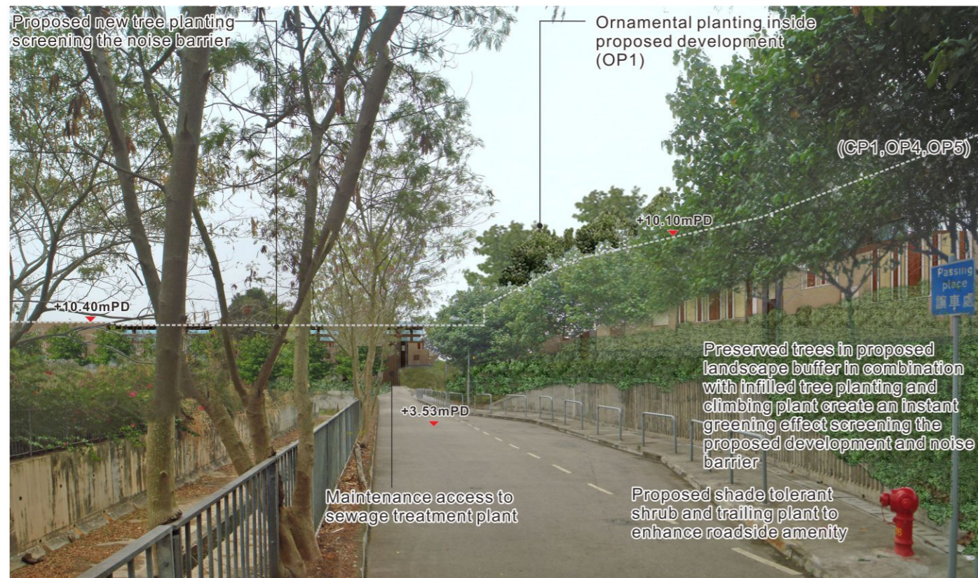
Day 1 of Operation Phase with landscape mitigation measures