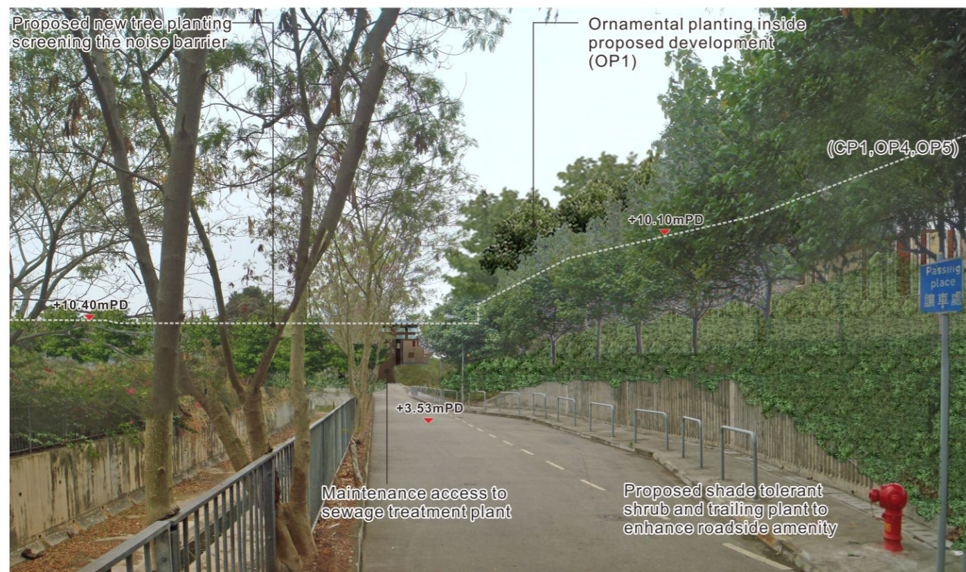
Year 10 of Operation Phase with landscape mitigation measures fully established