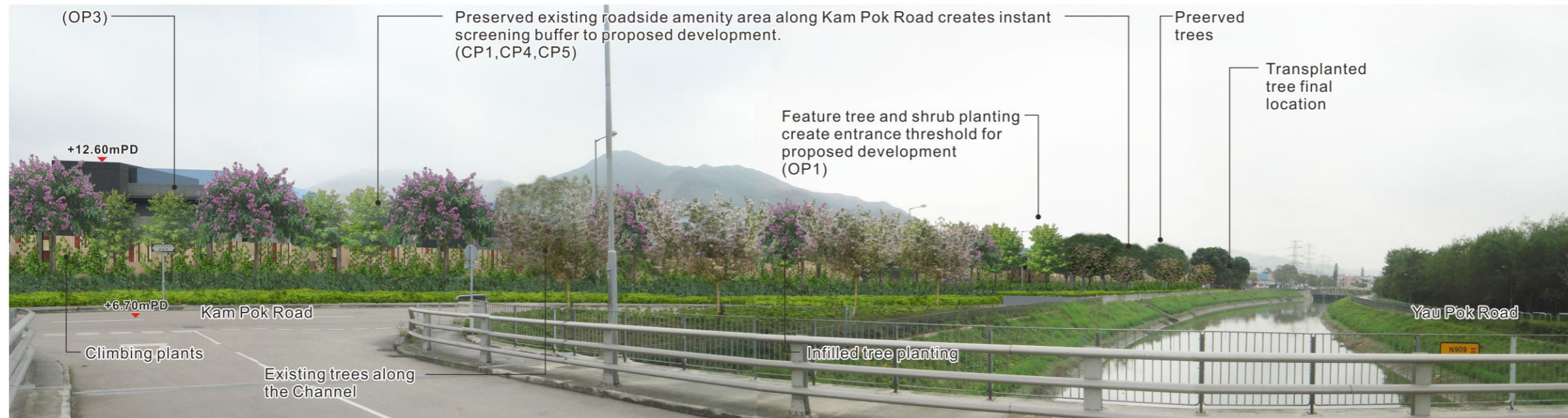
Day 1 of Operation Phase with landscape mitigation measures