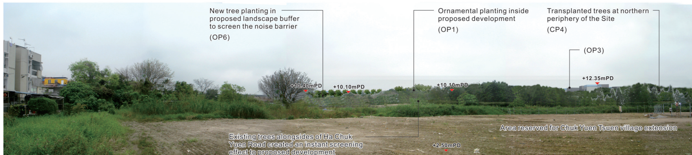
Year 10 of Operation Phase with landscape mitigation measures fully established