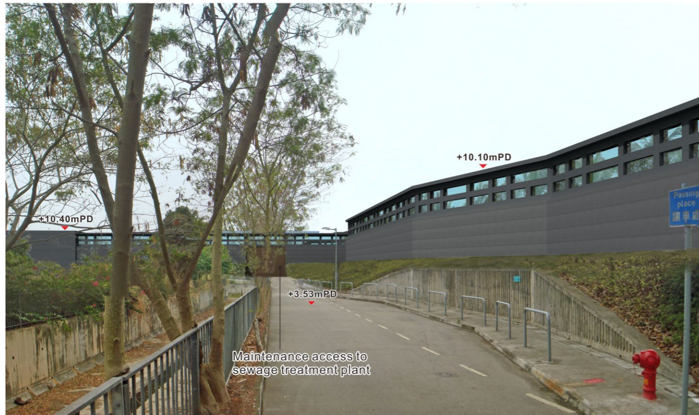
Day 1 of Operation Phase without landscape mitigation measures