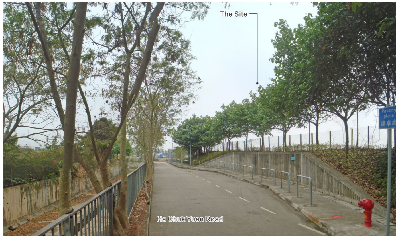
Existing Condition Looking southwest towards the development site at street level from Ha Chuk Yuen Road representing views from transient VSRs along Ha Chuk Yuen Road (VSR5)