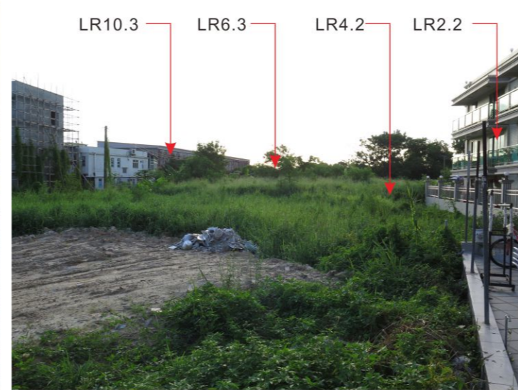
LR6.3 Chuk Yuen Tsuen South Ponds