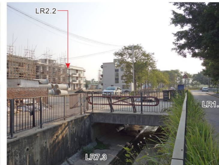
LR7.3 Ha Chuk Yuen Road Engineered Water Channel