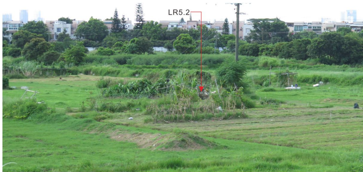
LR5.2 Yau Pok Road North Agricultural Field