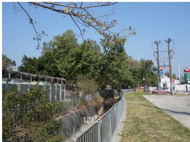
LR7.1 San Tam Road Engineered Water Channel