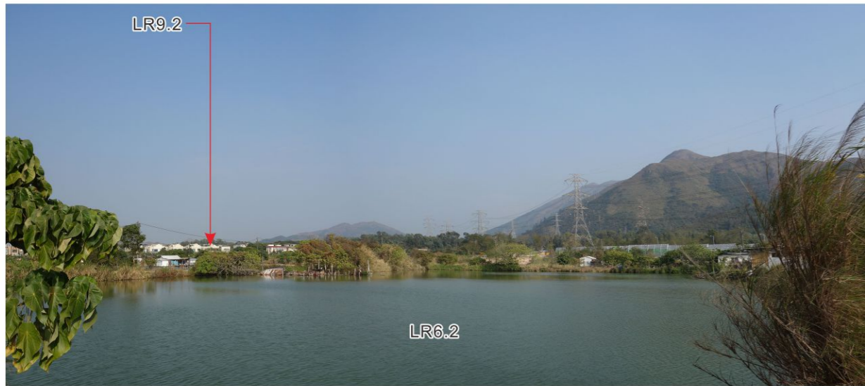
LR6.2 Man Yuen Chuen East Fish Ponds