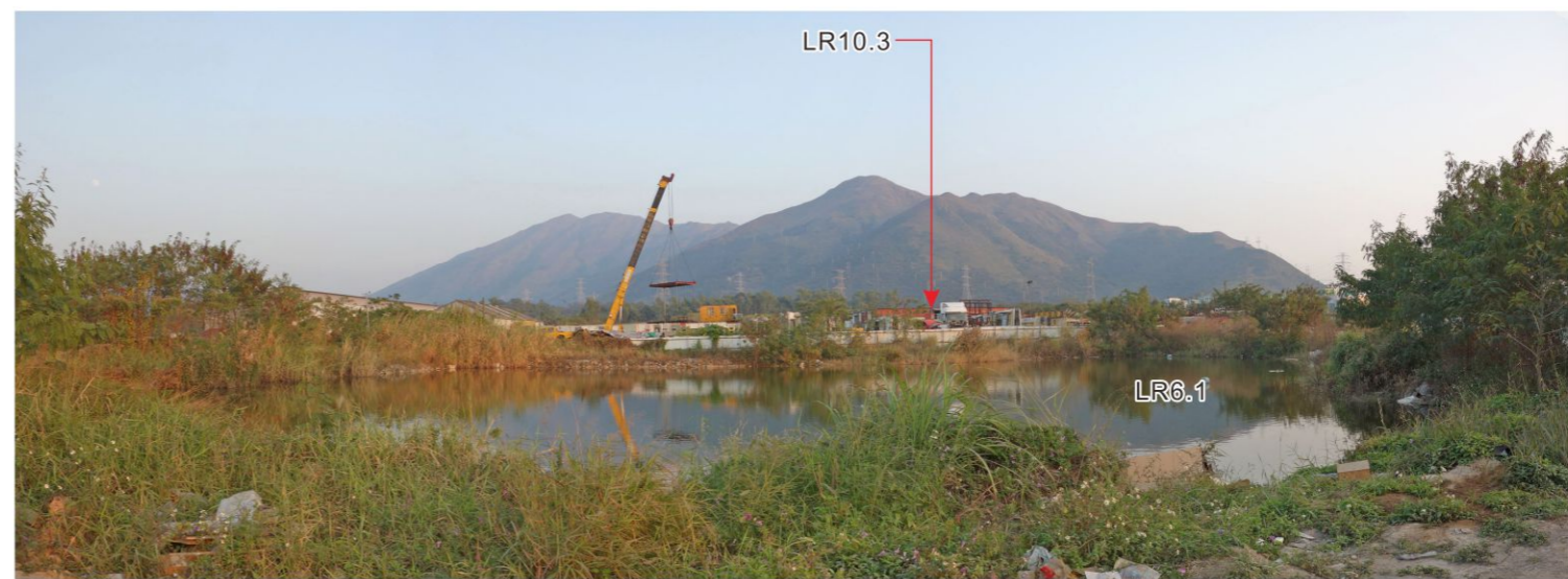
LR6.1 Ha San Wai Road North Fish Pond (Abandoned)