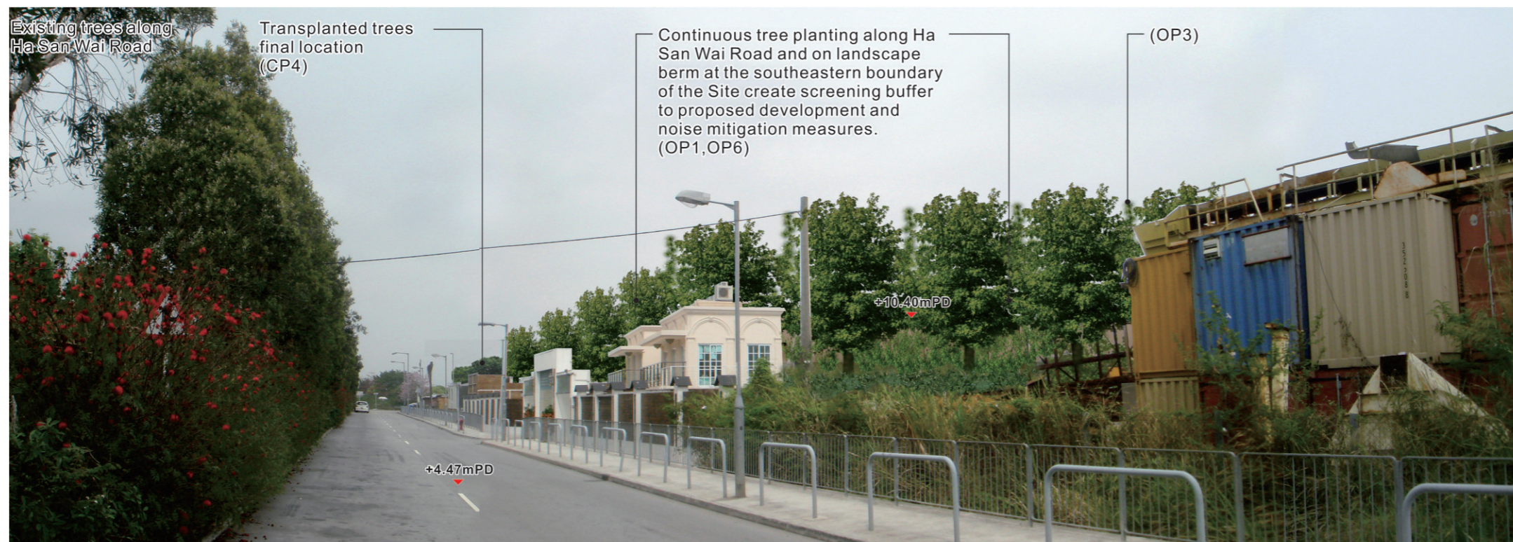
Year 10 of Operation Phase with landscape mitigation measures fully established