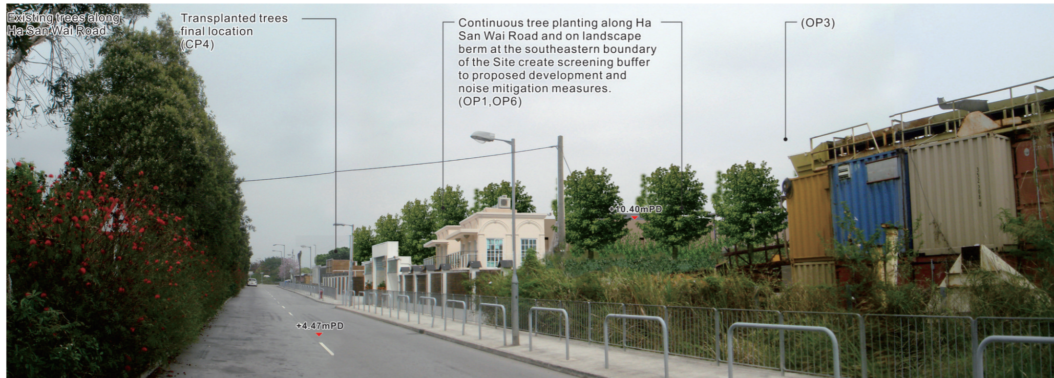
Day 1 of Operation Phase with landscape mitigation measures