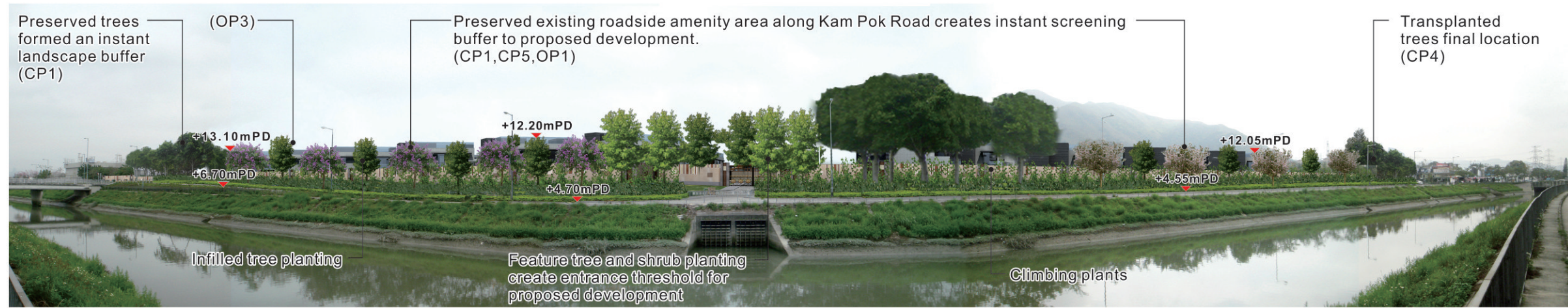
Day 1 of Operation Phase with landscape mitigation measures