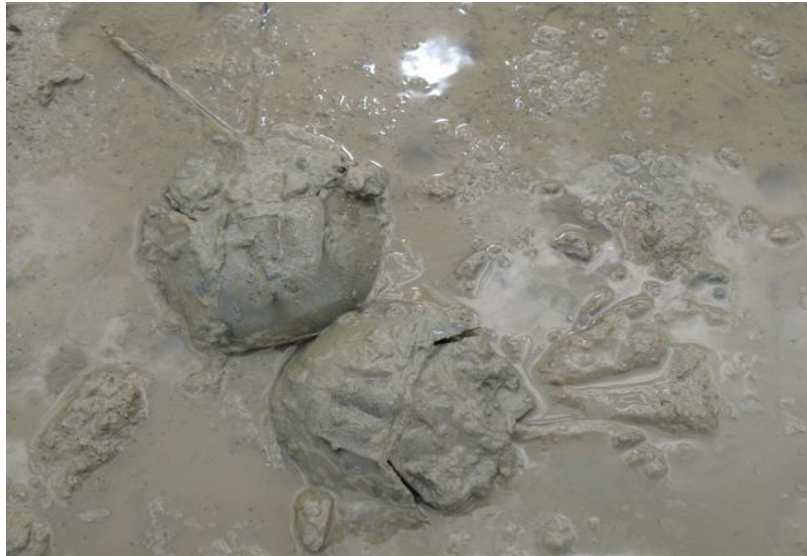
Horseshoe Crab ( Carcinoscorpius rotundicauda )