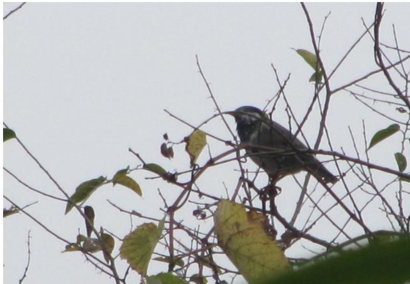
White-cheeked Starling ( Spodiopsar cineraceus )