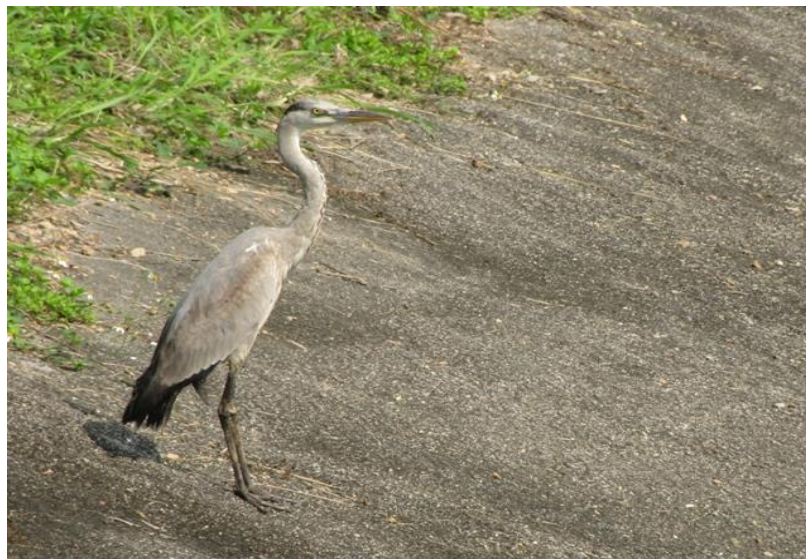
Grey Heron ( Ardea cinerea )