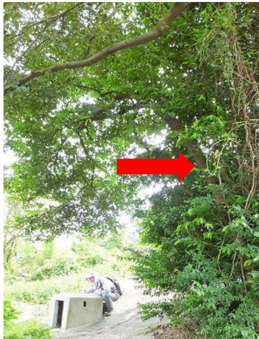
Incense Tree at Tung Tau Tsuen woodland