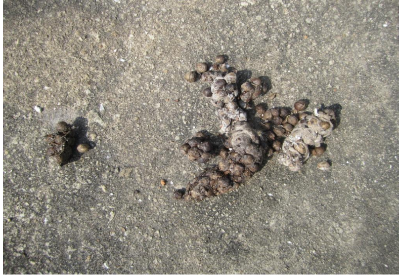
Scats of Small Indian Civet ( Viverricula indica )