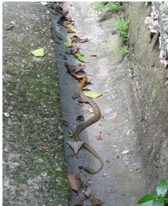
Buff-striped Keelback ( Amphiesma stolatum )