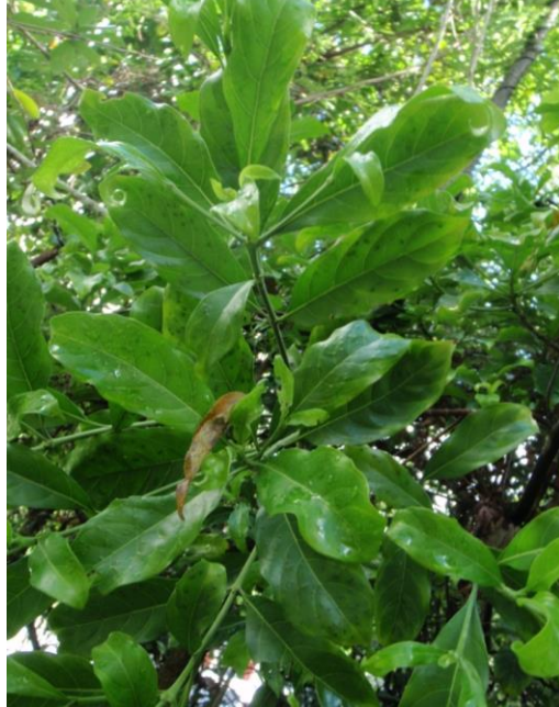
Hong Kong Pavetta ( Pavetta hongkongensis )