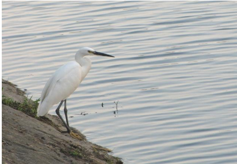
Little Egret ( Egretta garzetta )