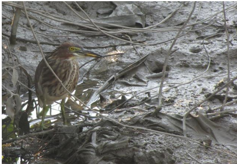
Chinese Pond Heron ( Ardeola bacchus )