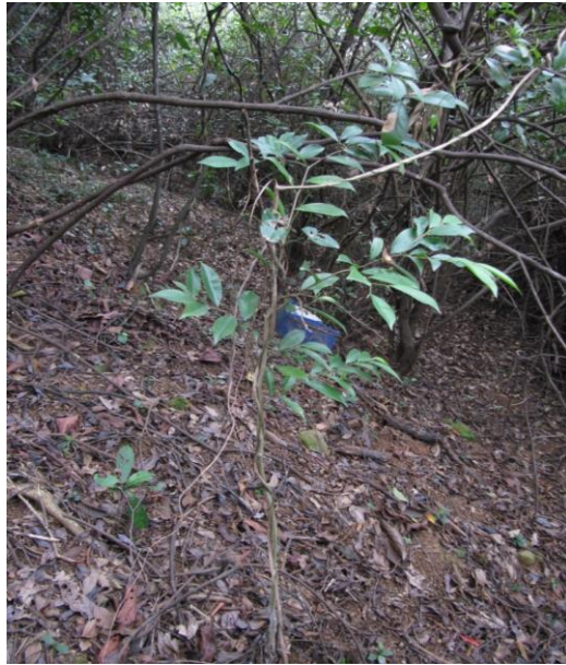
Incense Tree ( Aquilaria sinensis )