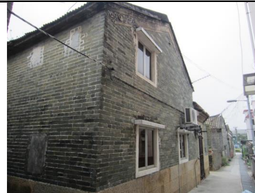
No.30, San Sang Tsuen