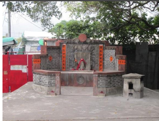
Shrine, Yick Yuen Tsuen: Octagon Earth God Shrine