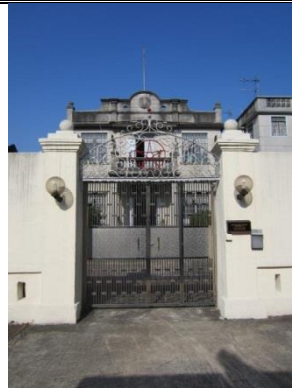
South of No. 30: Colonial Mansion