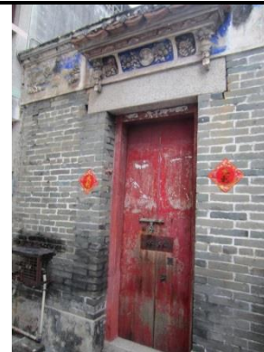
No.17, Tin Sam