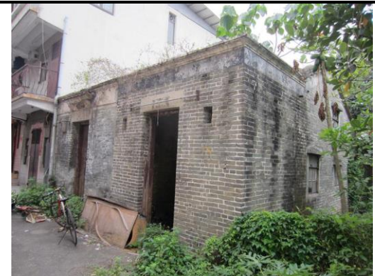
No. 10-11, San Uk Tsuen