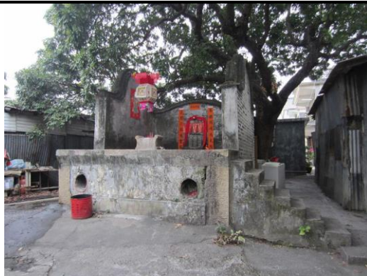
Shrine to the west: Earth God Shrine, Tin Sam