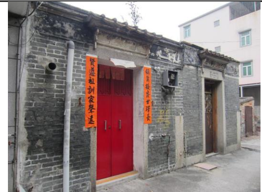
No. 17, San Uk Tsuen