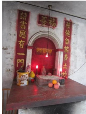
No. 6A: Shrine inside the Gate Tower