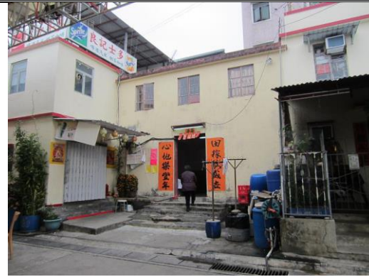
Entrance Gate of Tin Sam