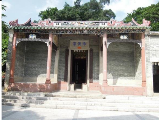
Yeung Hau Temple, Tung Tau Tsuen (Declared Monument)