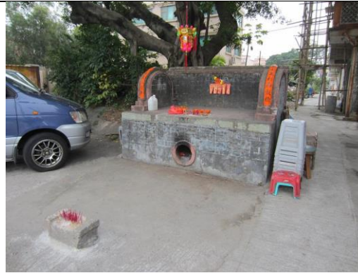
Shrine near No. 10A, Shek Po Tsuen