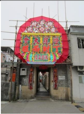
Entrance Gate of Shek Po Tsuen (Grade 3)