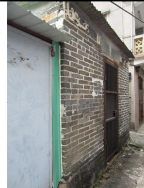
No.41, Shek Po Tsuen