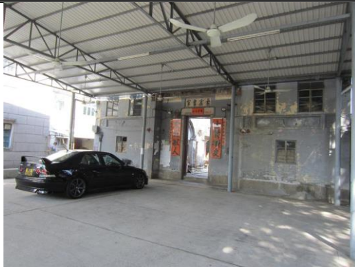
Shi Wang Study Hall (Grade 3)