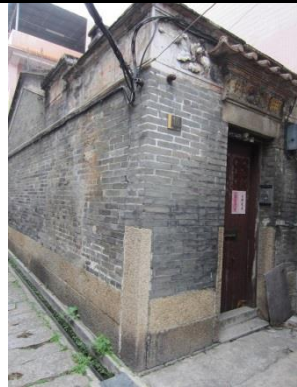
No.52, Shek Po Tsuen