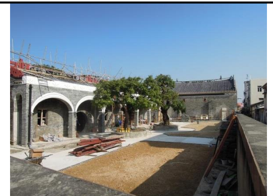
Yau Kung School main building of Tang Ancestral Hall, Ha Tsuen Shi (Declared Monument)