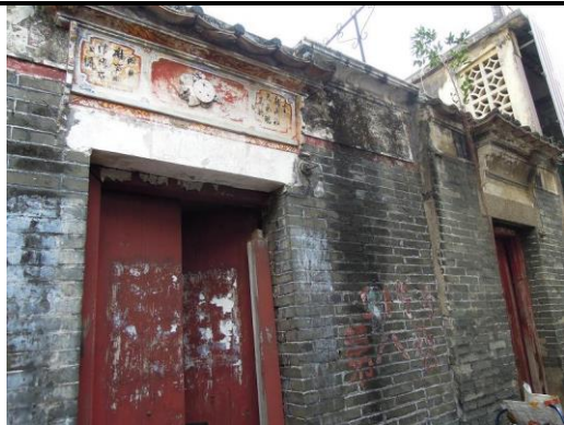
Terrace House, No.179, San Wai