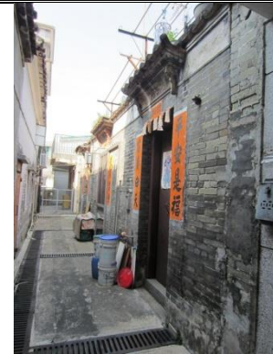
Terrace Houses, Nos. 170-172, San Wai