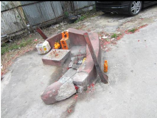
Shrine, San Lee Uk Tsuen