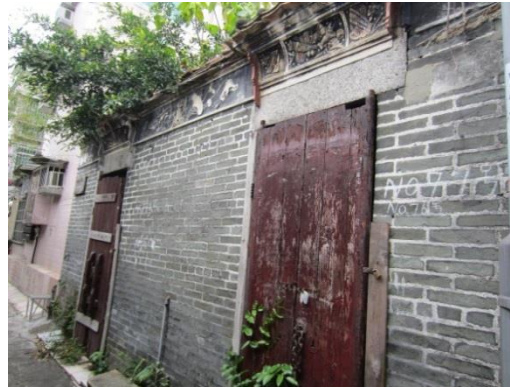
Nos.76-77, Hung Uk Tsuen (Grade 3)