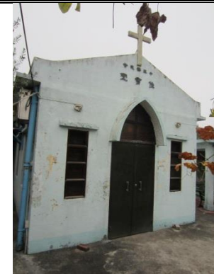
Kai Yum Tong Church, Yick Yuen Tsuen