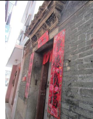
No.23 Tung Tau Tsuen