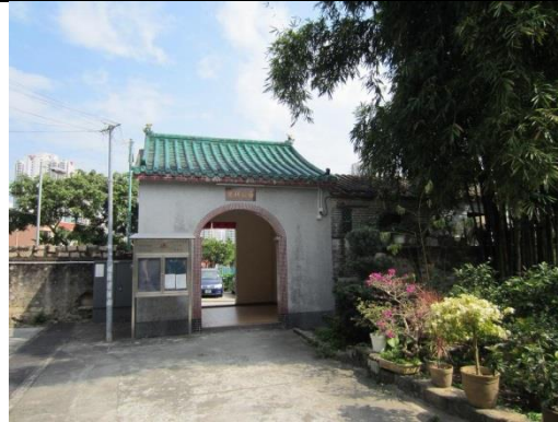
Old Village School, No.1 Tung Tau Tsuen