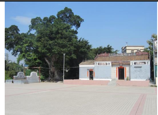
Yeung Hau Temple and Earth God Shrine, San Wai