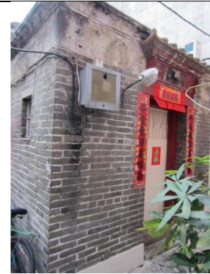
No.29, Shek Po Tsuen