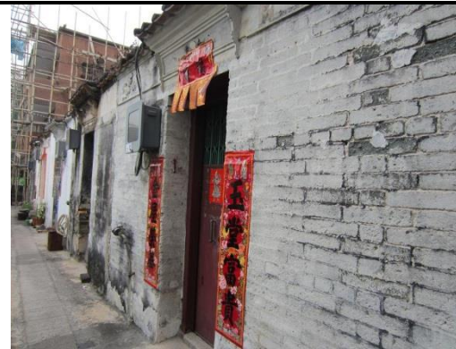
Nos.121-124, Sik Kong Tsuen