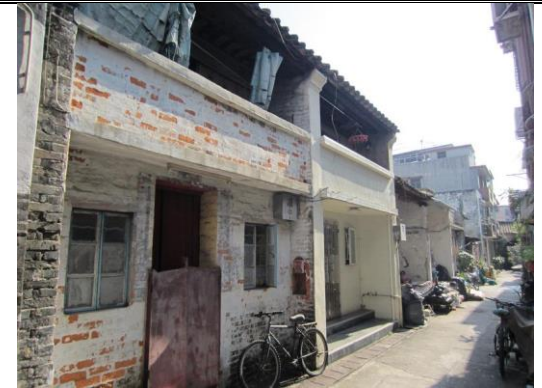
Terrace Houses, Nos. 23-27, Ha Tsuen Shi