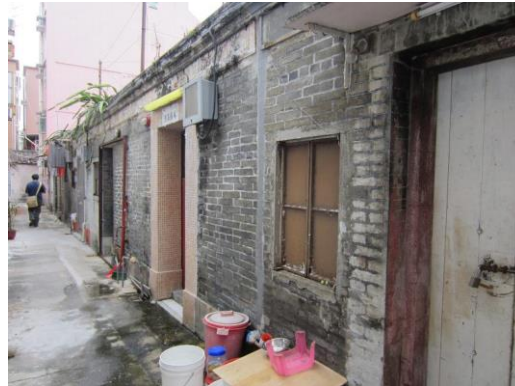
Terrace Houses, Nos.49-56 Sun Fung Wai