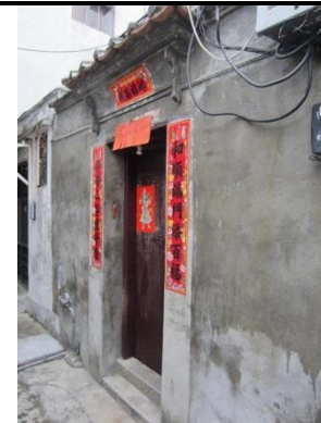
No.107, Chung Uk Tsuen