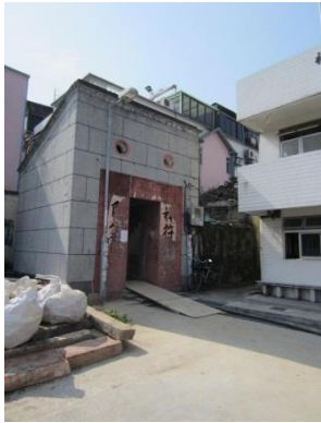
No. 6A: Entrance Gate of Sik Kong Tsuen