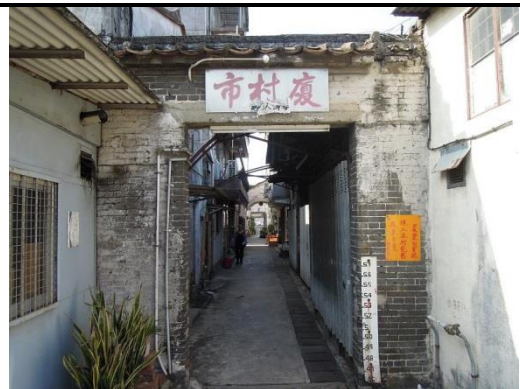
Gate near No.53: Eastern Gate, Ha Tsuen Shi