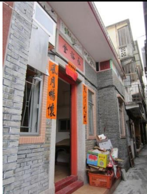
Wing Yu Tong, No. 109 Shek Po Tsuen