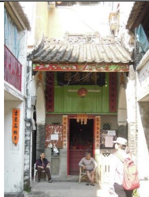
Kwan Tai Temple, No. 43A Ha Tsuen Shi (Grade 2)