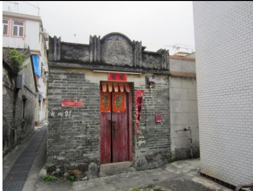
No. 21, Tung Tau Tsuen