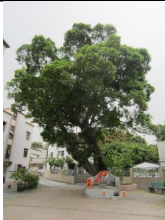
Shrine in Hong Mei Tsuen