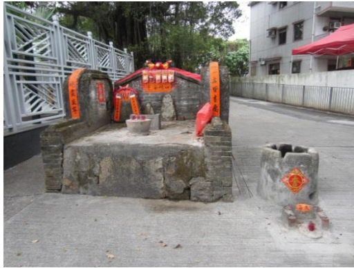
Shrine near No.1