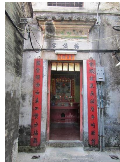
Yeung Hau Temple, No. 51B Sik Kong Wai