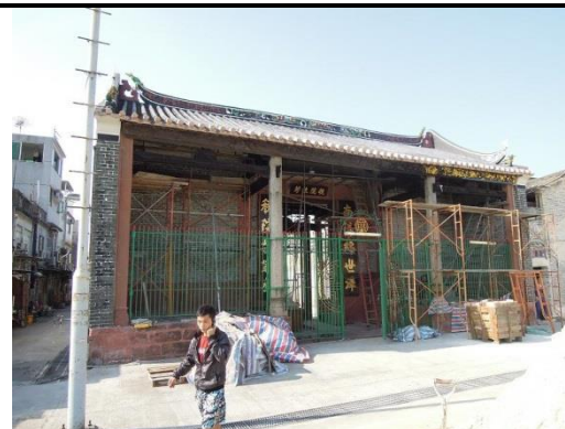
Tang Ancestral Hall, Ha Tsuen Shi (Declared Monument)