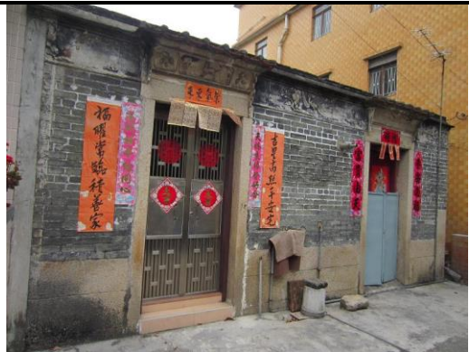
No. 20-21, San Uk Tsuen