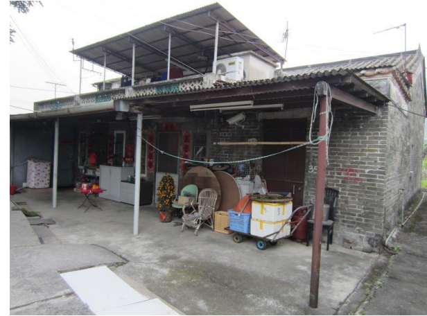
No.35, Tin Sam San Tsuen