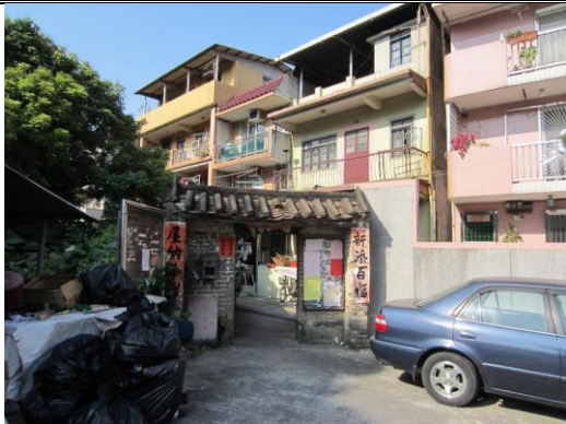
Entrance Gate, San Uk Tsuen