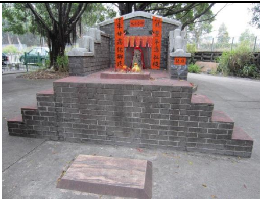
Shrine near No.89D, Sik Kong Tsuen