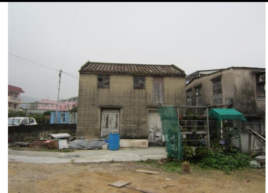
Building near No.31B