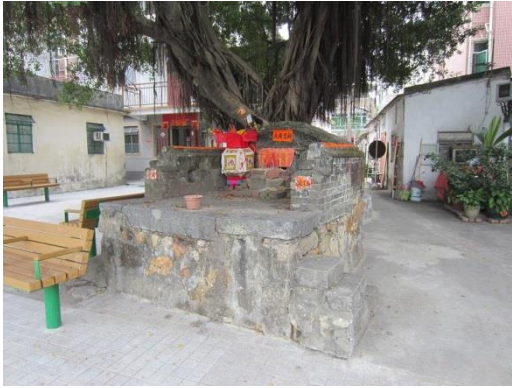
Shrine east of No.33