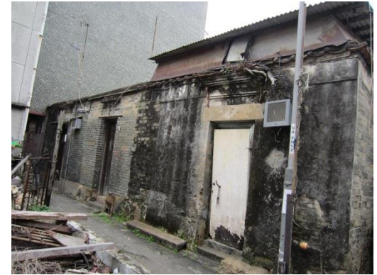
No.37, Hung Uk Tsuen