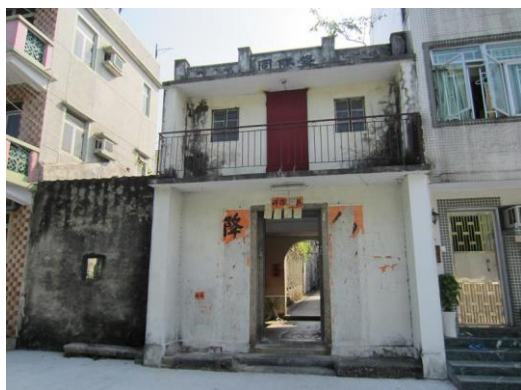
Entrance Gate of Sik Kong Wai