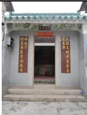
East of No. 106: Temple, Chung Uk Tsuen