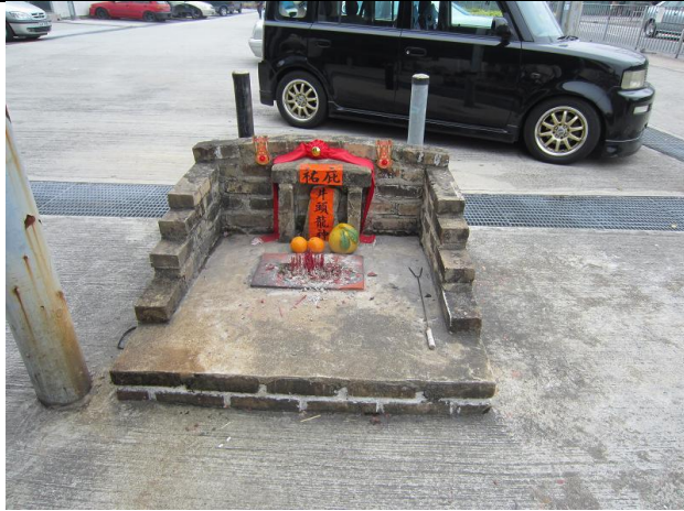
A Shrine to the east of No.9