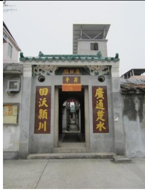
Entrance Gate of Chung Uk Tsuen