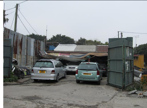
Building to the west of the Shrine, Kau Lee Uk Tsuen