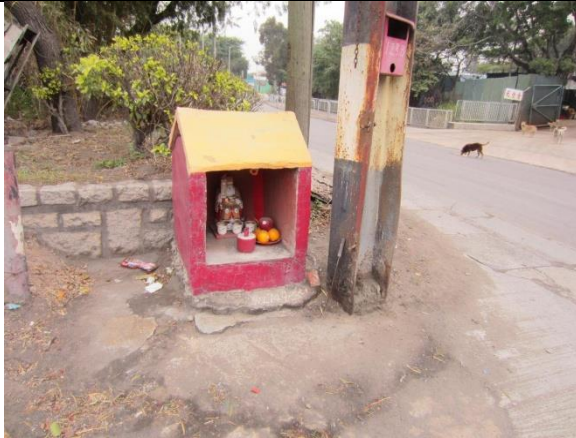
Shrine, Kau Lee Uk Tsuen