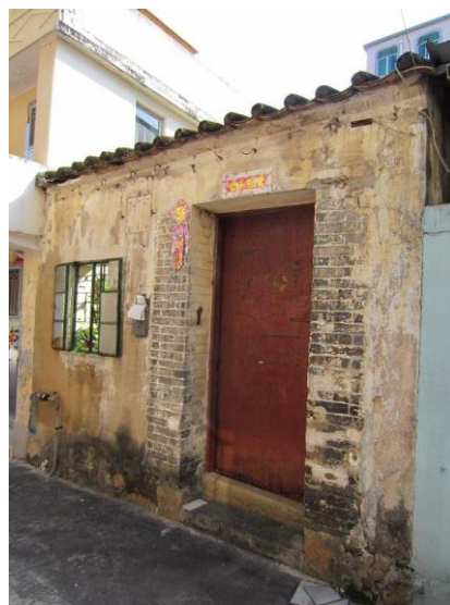
Terrace House, No.61, Sik Kong Wai