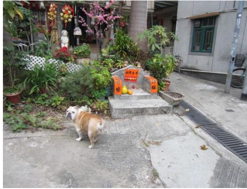
Shrine west of No.94