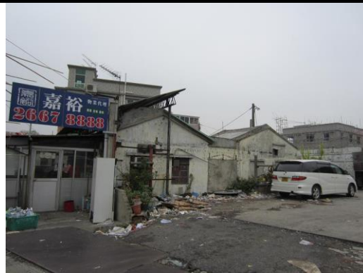
No.18, San Lee Uk Tsuen