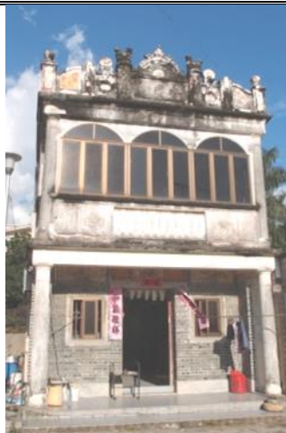
Lok Hing Tong, No. 78 San Hing Tsuen