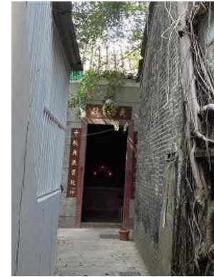
Wo Tei Temple, North of No. 18B Tseung Kong Wai