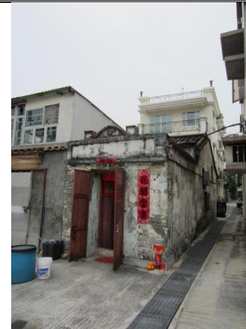
No.11, San Sang Tsuen