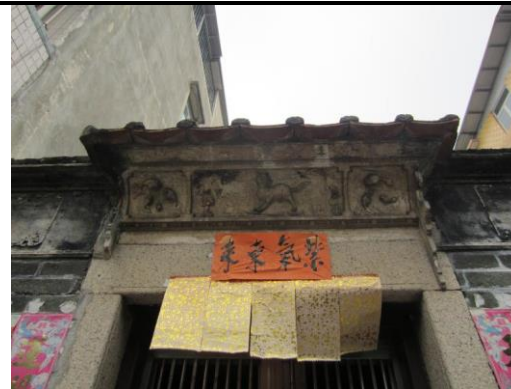
Motif on the Door of No. 20, San Uk Tsuen