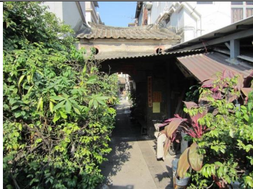
Gate Tower of Ha Tsuen Shi (Grade 2)