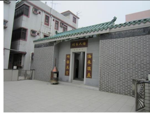
Chung Ancestral Hall