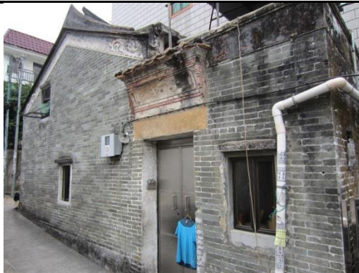
No.54, San Sang Tsuen