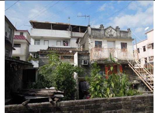
Terrace Houses, Nos. 62-63 Tung Tau Tsuen