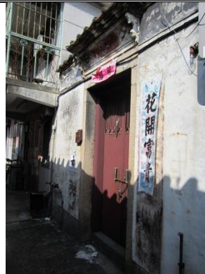
Terrace House, No.128, San Wai