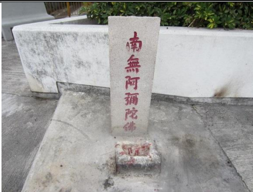
Carved Stone with Buddhist Blessing, Yick Yuen Tsuen