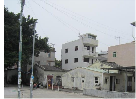
Nos.13-14, Lo Uk Tsuen