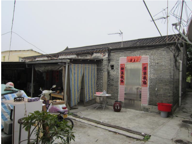
No.205, Tin Sam San Tsuen