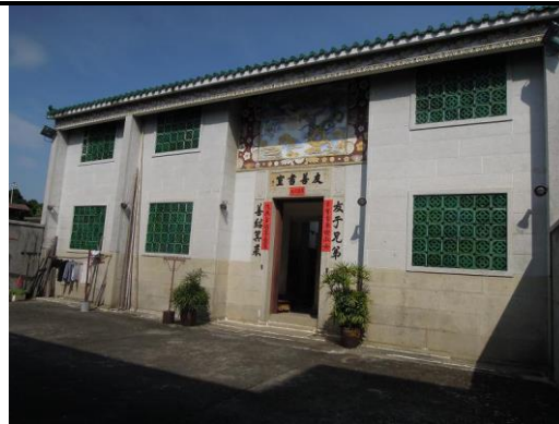
Yau Sin Study Hall, San Wai