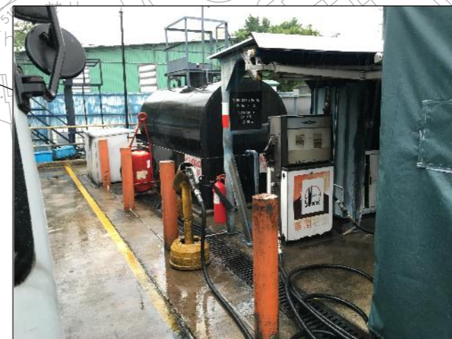
ABOVEGROUND DIESEL TANK & PETROL DISPENSER