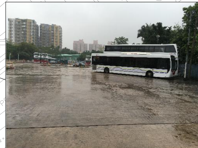
BUS PARKING AREA