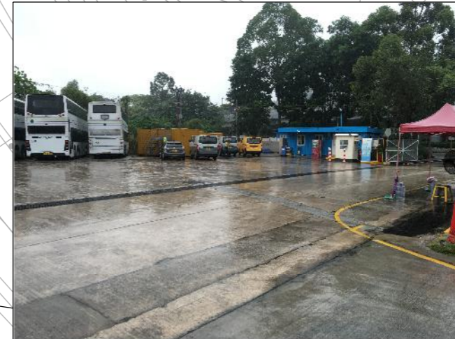
BUS PARKING AREA & CONTAINER OFFICES