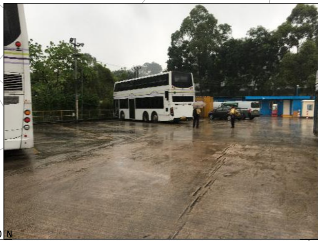
BUS PARKING AREA