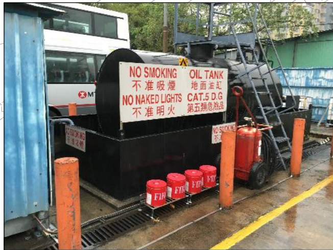
ABOVEGROUND DIESEL TANK & STEEL CONTAINMENT BUND