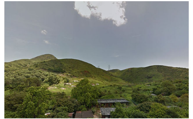
LR3 - Hillside Shrub and Grassland