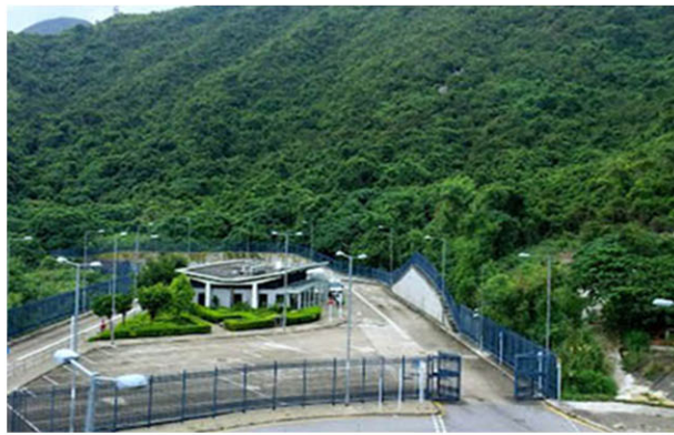
LR2 - Hillside Woodland