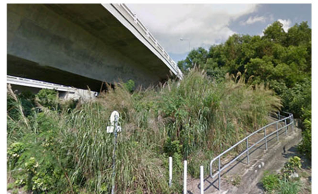
LR12 - Vegetation on Modified Slope