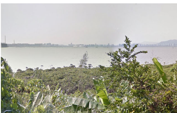
LR16 - Mangrove