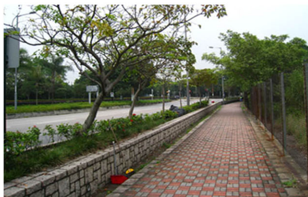
LR14 - Roadside Vegetation