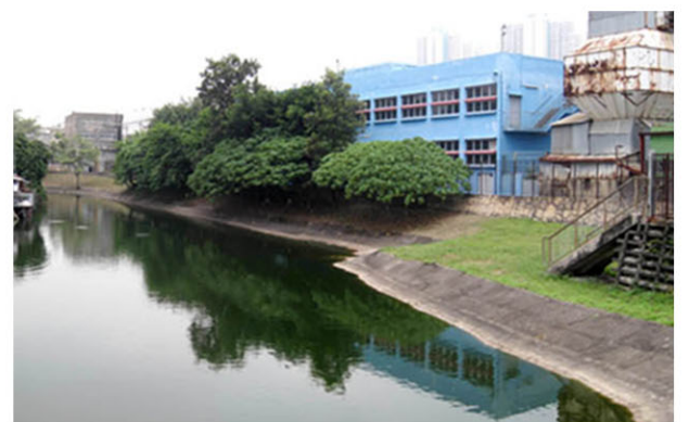
LR15 - Water Bodies