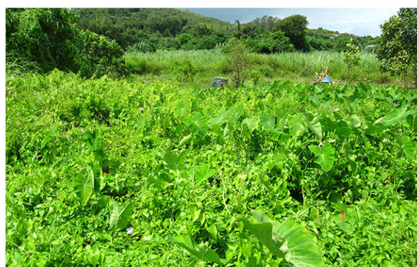
LR17 - Marsh