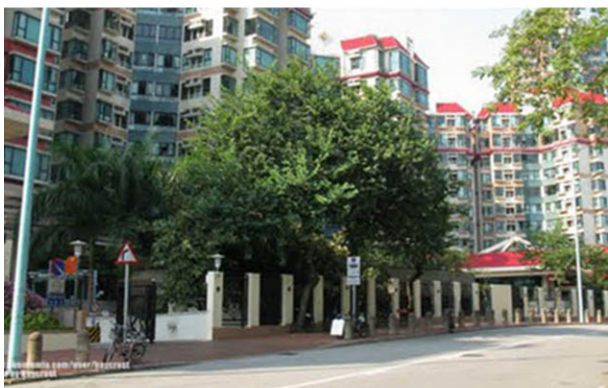
LR7 - Vegetation within Residential Developments