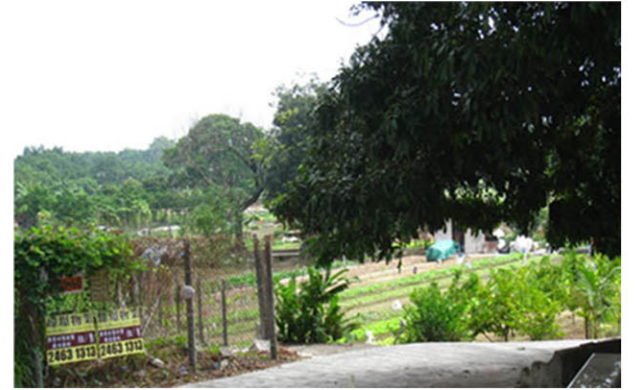
LR6 - Vegetation on Agricultural Land