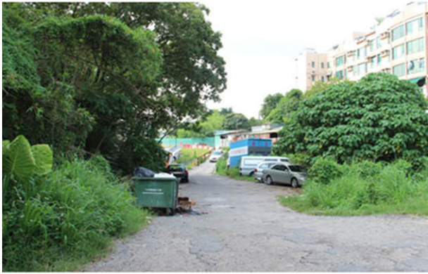
LR4 - Low-lying Woodland/Plantation