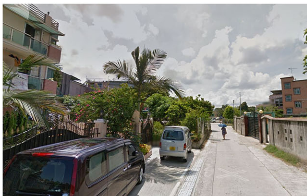
LR8 - Vegetation within Rural Village