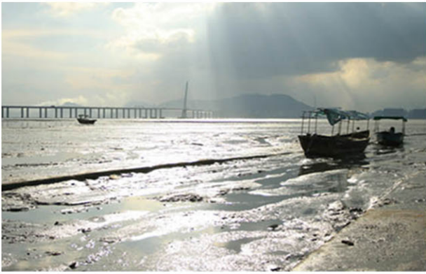
LR1 - Coastal Waters and Mudflats