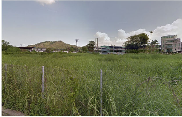
LR5 - Low-lying Shrub and Grassland