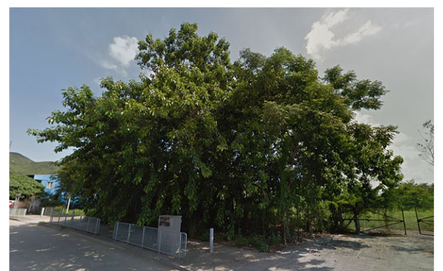
LR18 - Important Tree