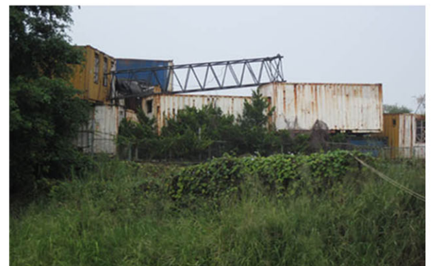
LR9 - Vegetation within Industrial Land and Open Storage