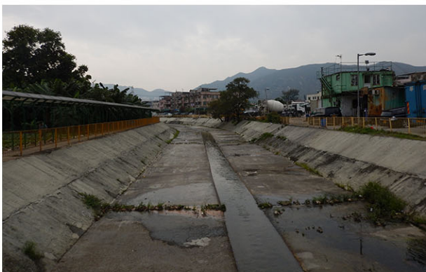
LR10 - Water Course