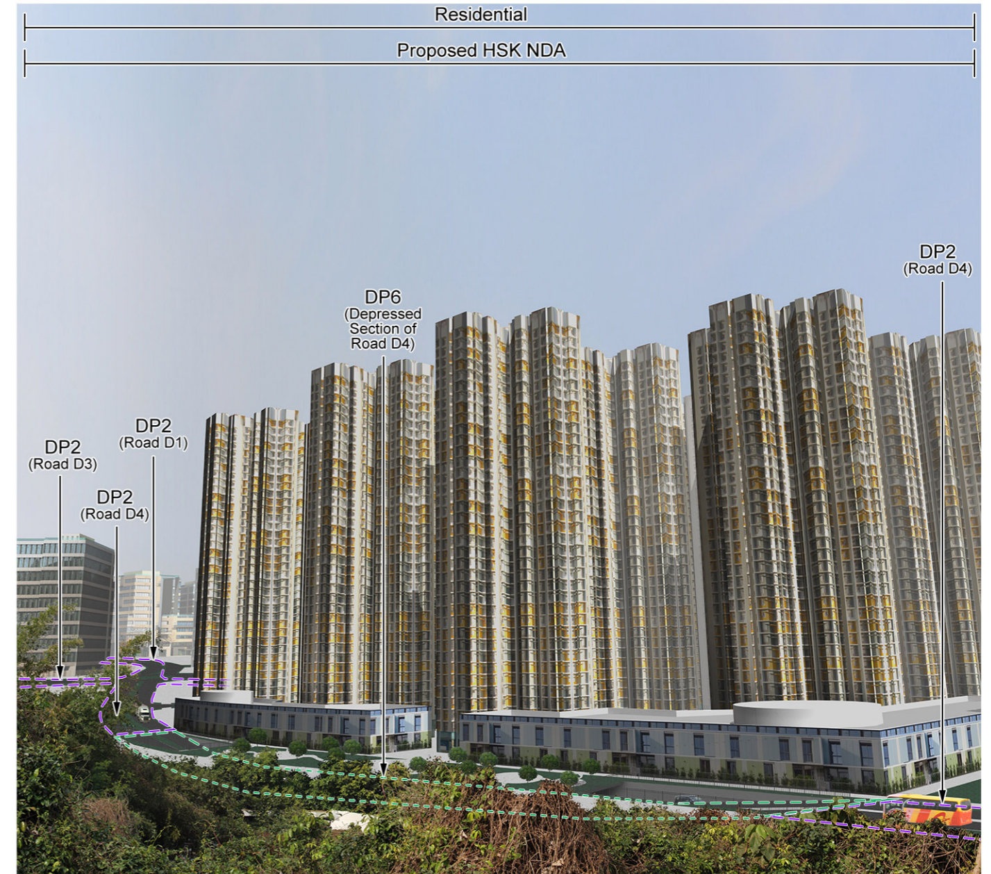
Proposed HSK Development without Mitigation at Day 1 (Operation Phase)

Note: The photomontages illustrating views at Day 1 represent the commencement of Operation Phase for the entire HSK development, with and without mitigation measures. The photomontages illustrating views at Year 10 of Operation Phase identify anticipated changes in mitigation measures from the Day 1 scenario. DP road alignments are indicated in coloured dashed lines to improve legibility where views are obstructed by other structures and landscape elements.