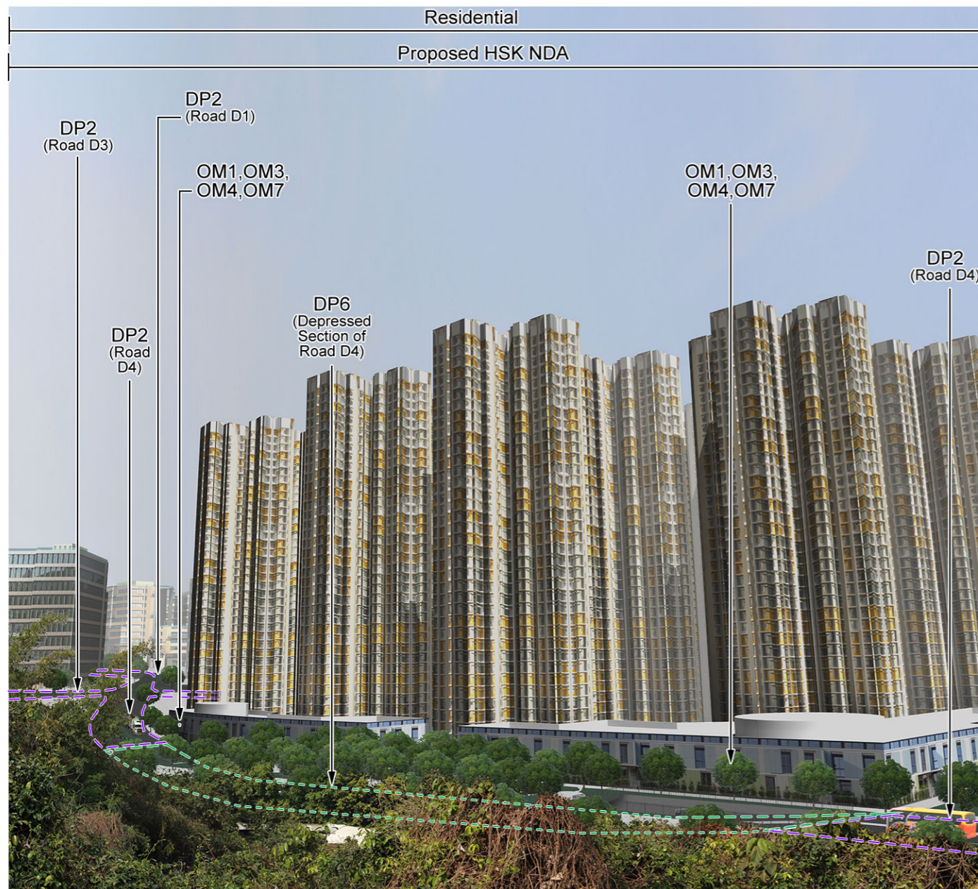
Proposed HSK Development with Mitigation at Day 1 (Operation Phase)