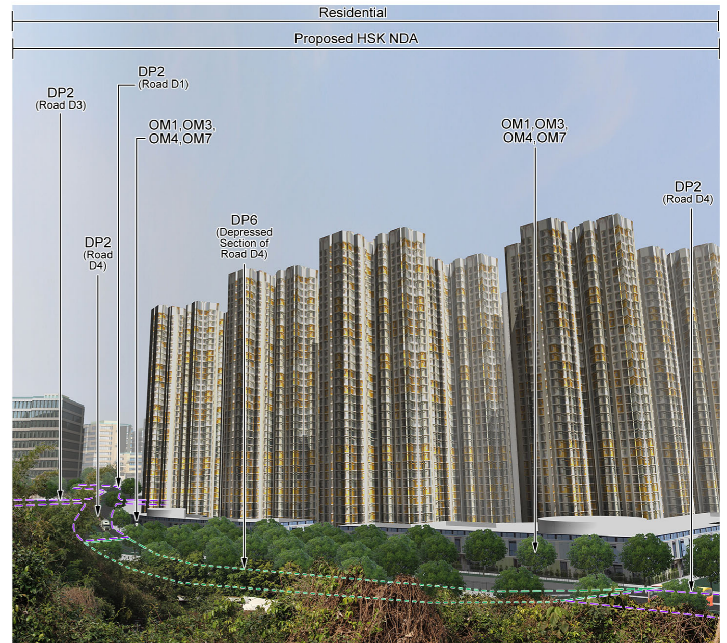
Proposed HSK Development with Mitigation at Year 10 (Operation Phase)