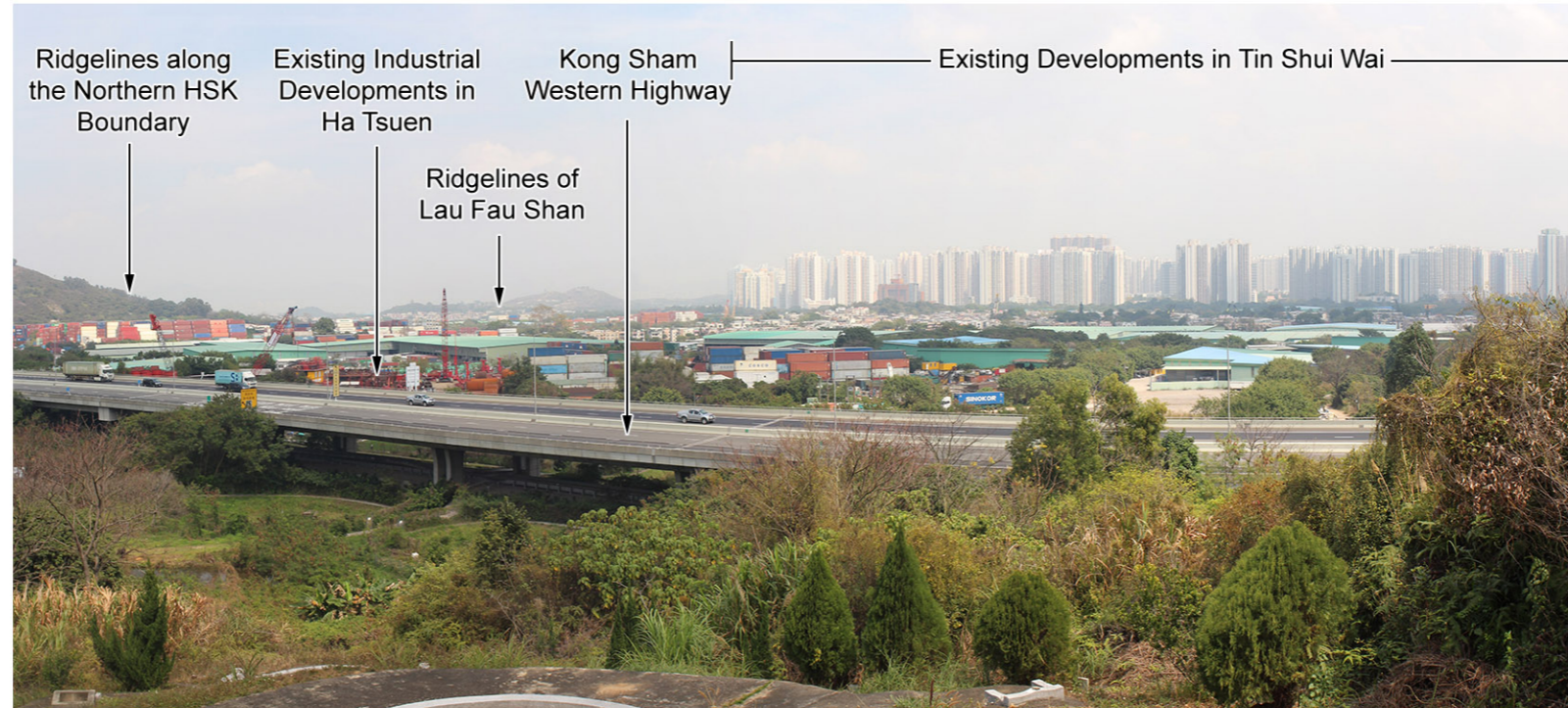
Existing Baseline Conditions