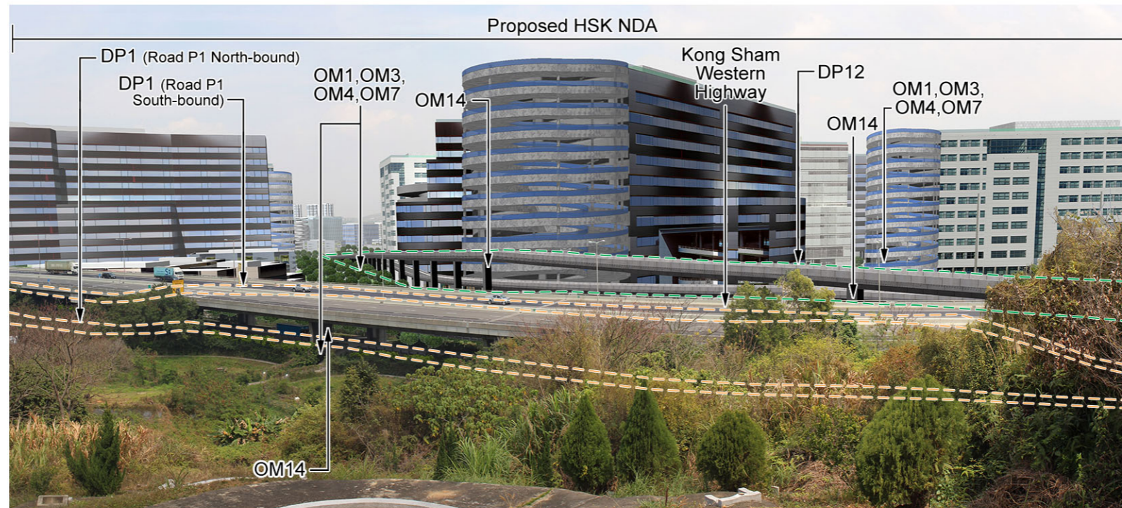
Proposed HSK Development with Mitigation at Day 1 (Operation Phase)