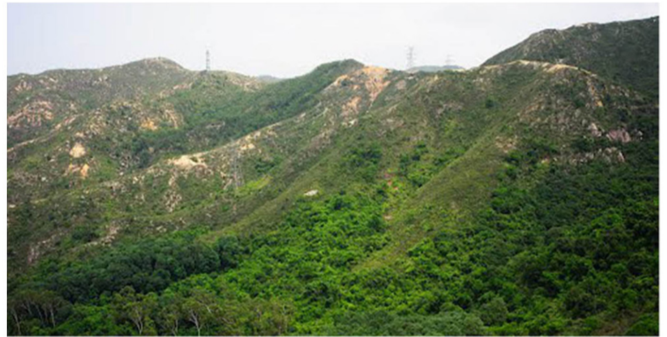
LCA4 - Upland and Hillside Landscape