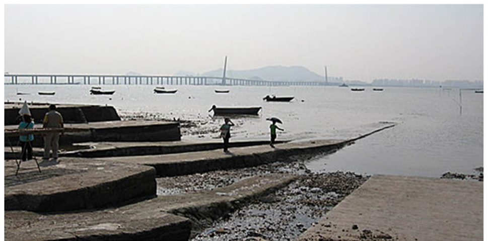
LCA8 - Inter-tidal Coastal Landscape