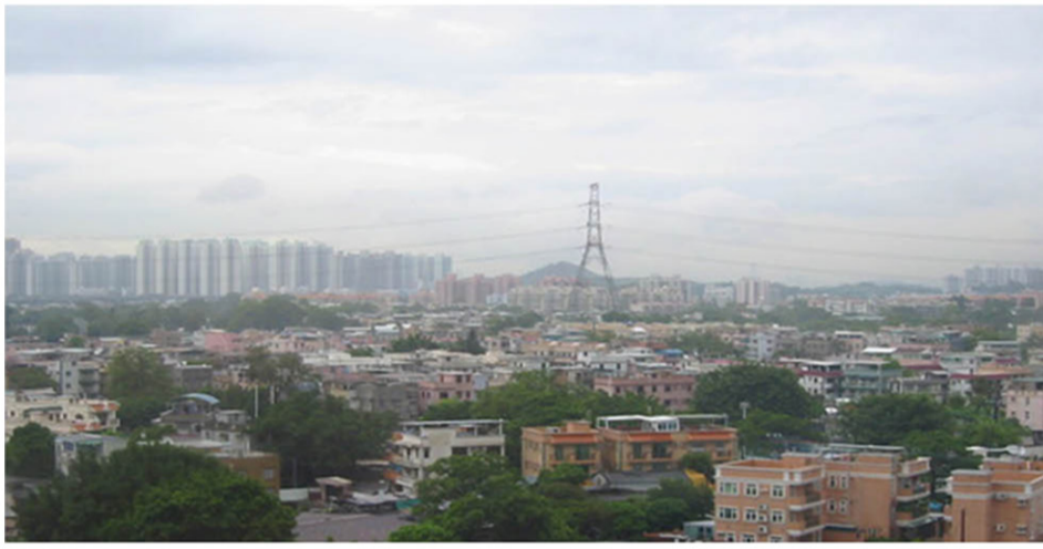
LCA1 - Miscellaneous Rural Fringe Landscape