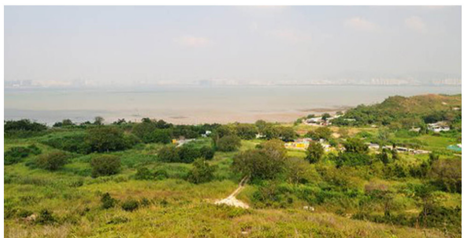
LCA6 - Rural Coastal Plain Landscape