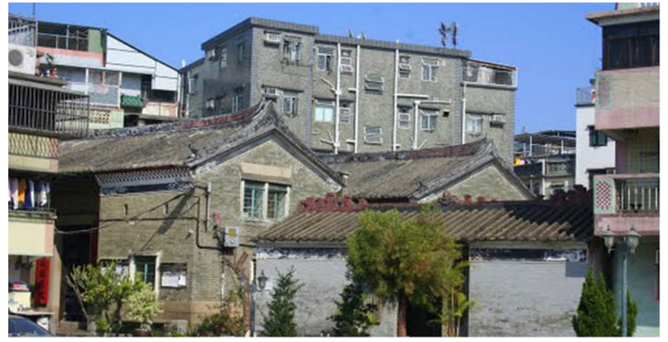
LCA2 - Miscellaneous Urban Fringe Landscape