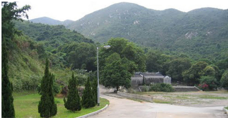
LCA5 - Settled Valley Landscape