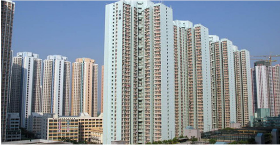
LCA3 - Residential Urban Landscape