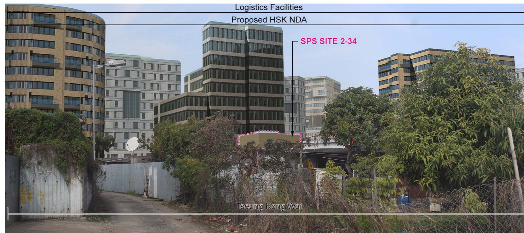
Proposed HSK Development without Mitigation at Day 1 (Operation Phase)

Note: The photomontages illustrating views at Day 1 represent the commencement of Operation Phase for the entire HSK development, with and without mitigation measures. The photomontages illustrating views at Year 10 of Operation Phase identify anticipated changes in mitigation measures from the Day 1 scenario.