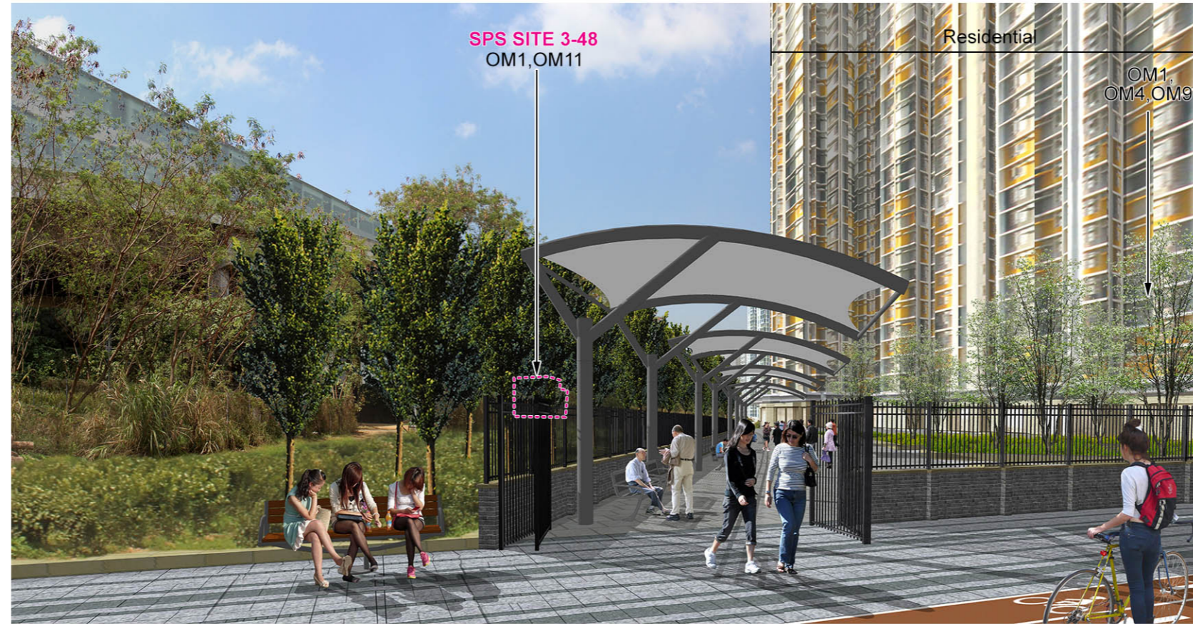
Proposed HSK Development with Mitigation at Day 1 (Operation Phase)