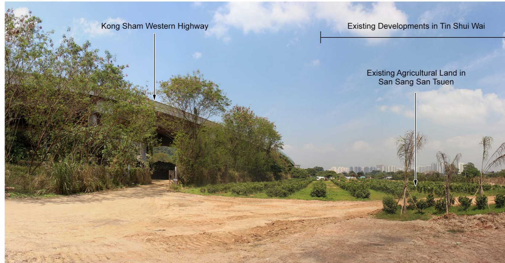
Existing Baseline Conditions