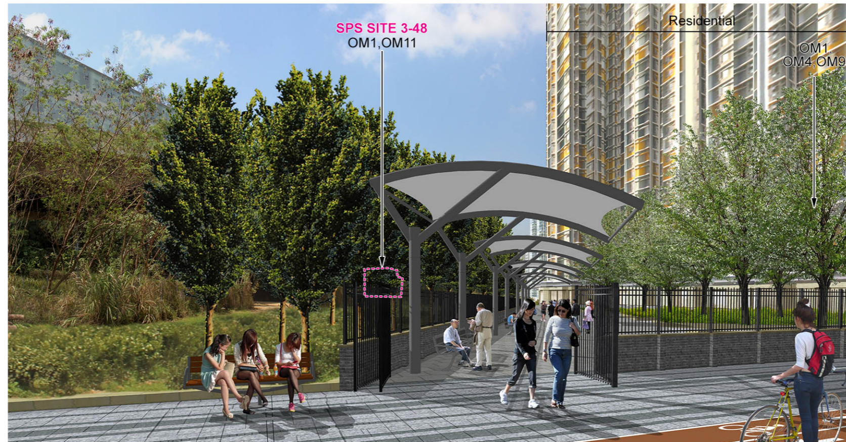
Proposed HSK Development with Mitigation at Year 10 (Operation Phase)