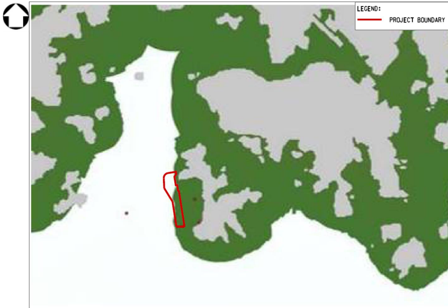
Figure 1: Inter-nesting locations (red dots) from June 25 to September 4, 2003 of the green turtle (named “Hong Kong 2”) that nested on Sham Wan, Lamma Island. (Map provided by AFCD) Reference: ERM (2010). Development of an Offshore Wind Farm in Hong Kong – EIA Study. For the Hong Kong Electric Co. Ltd. In: website of EPD [ http://www.epd.gov.hk/eia/register/report/eiareport/eia_1772009/HTML%20version/EIA%20Report/Figures/Fig9A.6.pdf ]