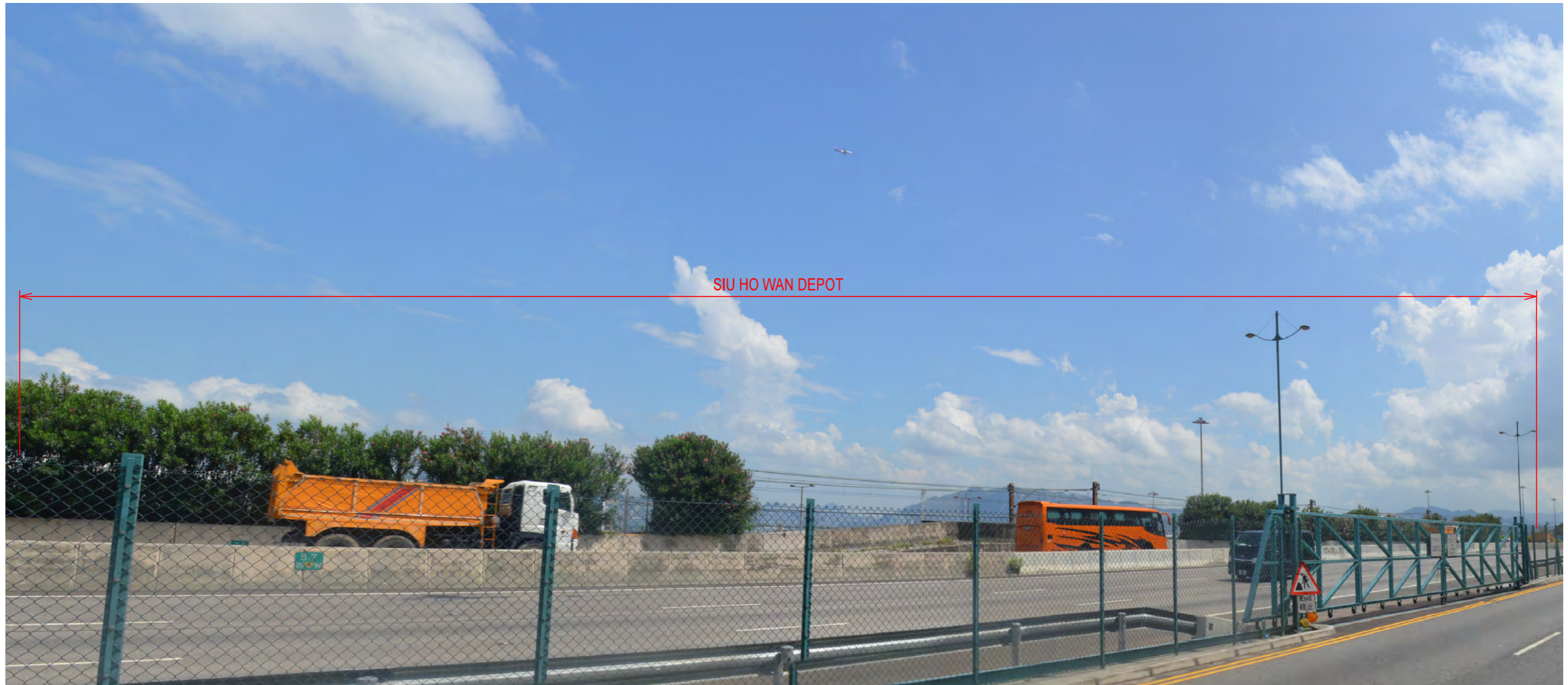
VSR 13 CHEUNG TUNG ROAD (APPROX. 50M) TYPE OF VSR : TRANSPORTATION