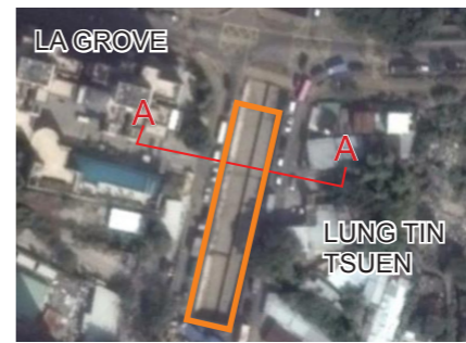
Key Plan (Note: Ingress and outgress to be allowed for semi-enclosures for Kung Um Road and Kiu Hing Road)