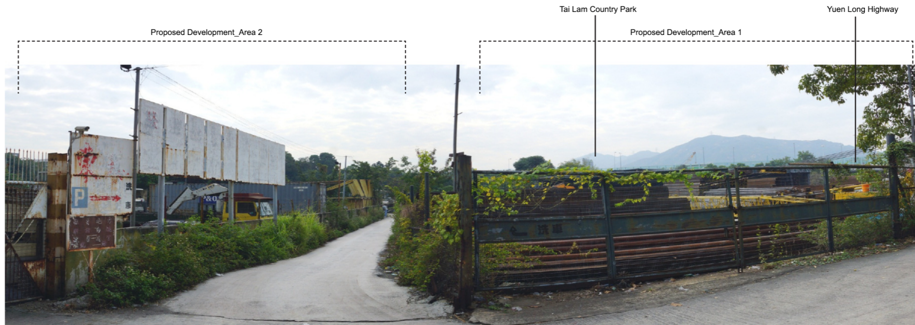
VSR8 Tong Yan San Tsuen Interchange