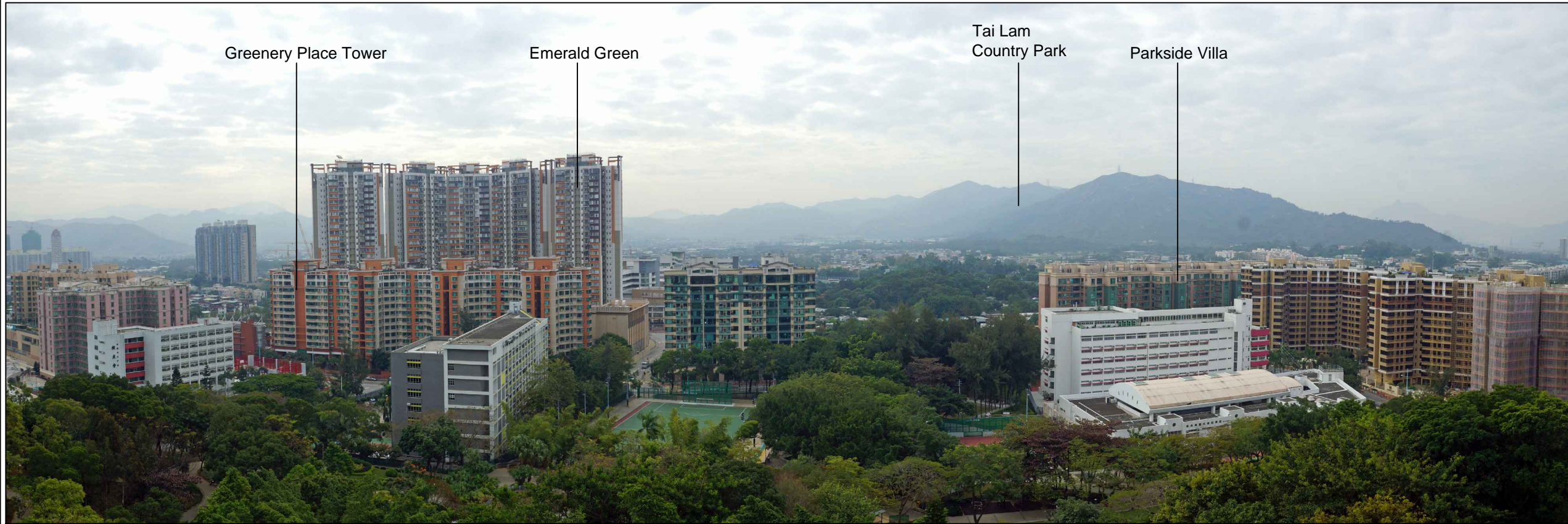
VSR1 Yuen Long Park - Existing View (Approx. 540m)