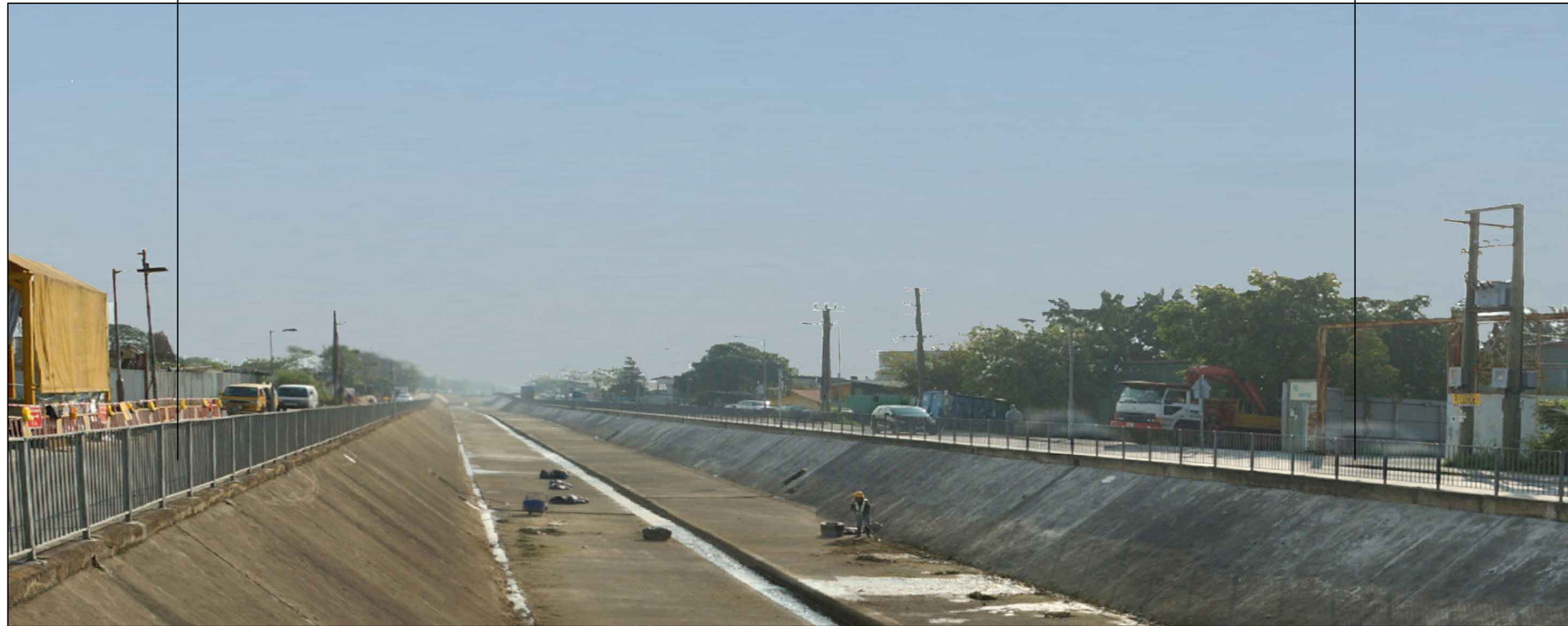
VSR13 Pathway near Muk Kiu Tau Tsuen - Existing View (Approx. 15m)