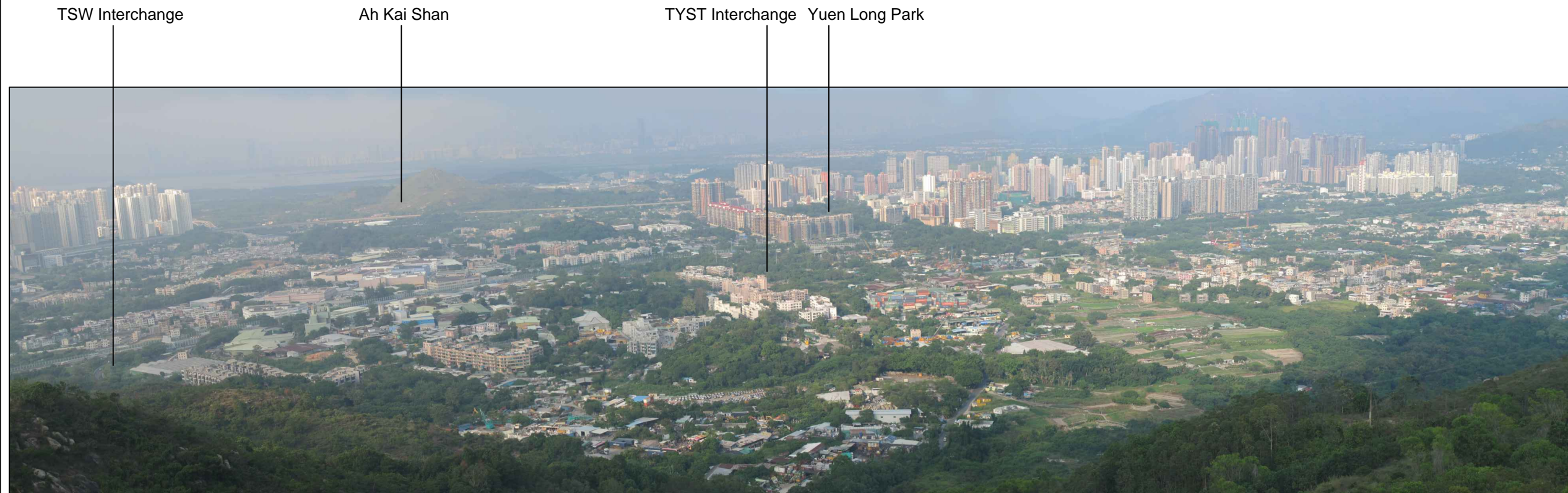
VSR18 Tai Lam Mountain 1 Facing Northeast - Existing View (Approx. 1200m)