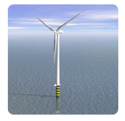
A wind turbine of an offshore wind farm<sup>315</sup>