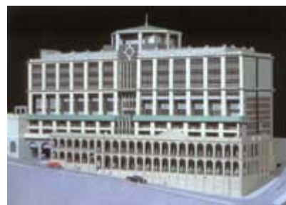
District Community Centre and Singleton Hostel at Sai Ying Pun - preservation of the granite verandah of the old Mental Hospital