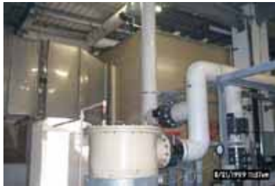
Water scrubber to reduce odours

A spraying system for non-toxic agents will be used to neutralise odours when necessary and help reduce the odour nuisance level.