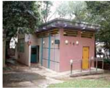
Public toilet in Sheung Shui - before refurbishment (left) and after refurbishment (right)

Use of skylight and louvres to enhance natural lighting and ventilation