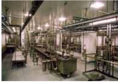
Fully automatic mechanised slaughter line