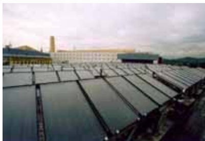
Provision of 450 solar panels to pre-heat water

Hot water is one of the main consumable resources in the building's operations. The consumption rate is 650m 3 per day, which is equivalent to the usage by 8,000 normal households. We have adopted the use of solar panels, which is an environmentally friendly method, for the pre-heating of water. Further heating is by the heat pump system which utilises the rejected heat from the air-cooling operation to further heat up the water.