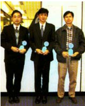
Representatives of winning teams awarded for "The Best Performer in Environmental Targets"

To promote staff awareness, our Property Services Branch introduced the award to the teams who are "The Best Performer in Environmental Targets"