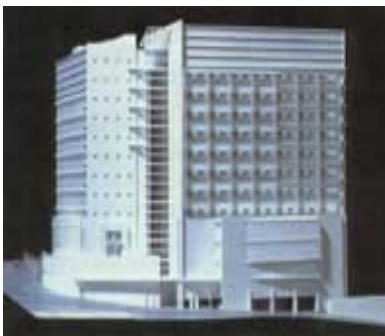
Use of study model to explore the environmental design option