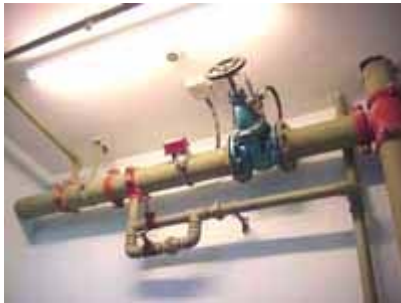
Prefabricated main water pipe joint Target : 90% new projects