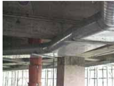
Prefabricated air duct Target : 50% new projects