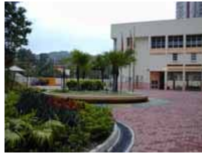
Extensive soft landscaping to standard schools