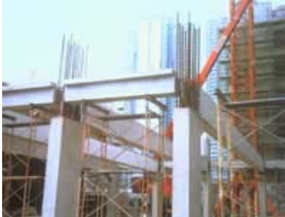
Use of system design for construction of standard school

In 1999, 5 schools in Tseung Kwan O successfully used "system design formwork" and substituted the traditional timber formwork with precast construction and metal formwork. The improved quality of concrete finish resulted in a reduction of thick rendering on walls and there was approximately a 30% reduction in construction waste.