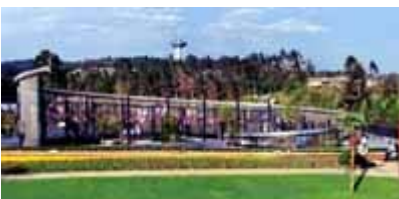
Hong Kong Garden - Windows of China - received 9 awards in the 1999 Kunming International Horticultural Exposition (1 contribution, 1 gold, 5 silver and 2 bronze)