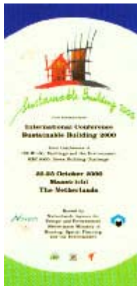
Participation in the Green Building Challenge

We are fully committed in the continuous improvement of our environmental performance. We would be glad to receive any comments you may have to help us improve the future editions of our environmental report.