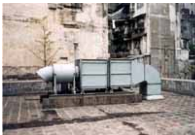
Existing carbon filtration system in RCP

To minimise the offensive odour generated from the refuse collection points (RCP), ArchSD has undertaken extensive improvement works in the RCP's ventilation system by replacing the existing carbon filtration system with the more sophisticated water scrubber system. By forcing air currents through a water chamber, the system is effective and reliable in removing the unpleasant gases, thus reducing the odour nuisance to an acceptable level stipulated in the environmental guidelines.