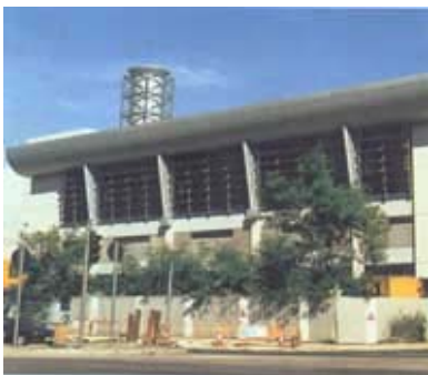
Use of sun shading device