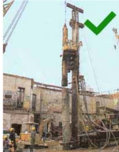
Phasing out of diesel hammer percussive piling with more environmentally friendly mini-piles to reduce air and noise pollution