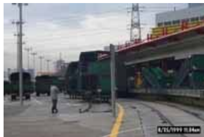
Direct off-loading of livestock from train to lairage

The site for the new slaughter house is chosen because of its isolation from urban areas and convenience to rail. The trains no longer have to go into town and people living along the railway line need not suffer the noise and odour nuisance caused by the pigs and cattles. With a purpose-built railway siding, trains carrying livestock will off-load directly to the lairage.