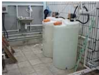
Water scrubber system to reduce odour nuisance