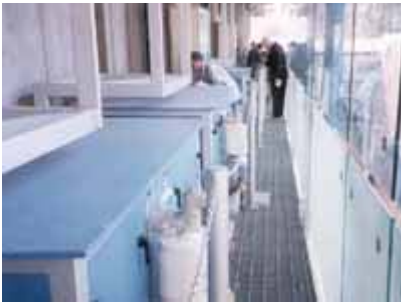
Kadoorie Biological Science Building, University of Hong Kong - double skin design to facilitate maintenance of service plant and reduce solar heat gain