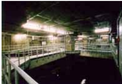
Underground water treatment tank

The slaughter house has an independent and innovative treatment system which treats water using bacteria and other micro-organisms. The 5,000m 2 of effluent generated daily will be treated by the biochemical waste water treatment plant to normal domestic waste water standards.