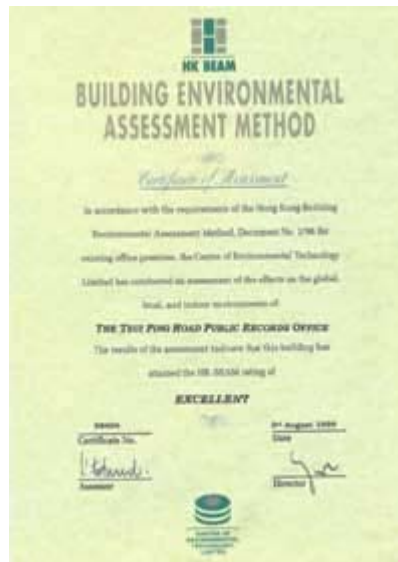
Public Records Office assessed with "Excellent" rating under the HK-BEAM (Hong Kong Building Environmental Assessment Method)