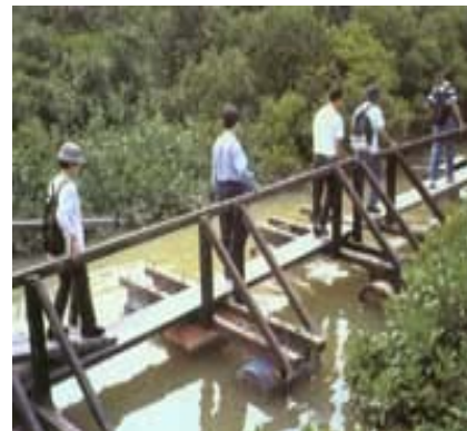
Training visit for staff - Mai Po Marshes in September 1999 (to get acquainted with the ecosystem )