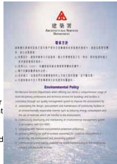
ArchSD's Environmental Policy