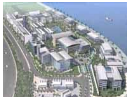
Science Park at Pak Shek Kok