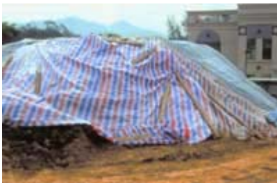
Soil, rubbles, bricks, concrete / cement lumps