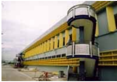
Acoustic louvres for noise mitigation