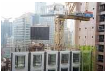
Visit to hotel site at Causeway Bay employing prefabrication technology