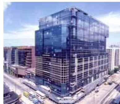
Cheung Sha Wan Government Offices - OTTV 20\text{W}/\text{m}^2