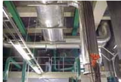
Prefabricated metal mounting brackets Target : 50% new projects