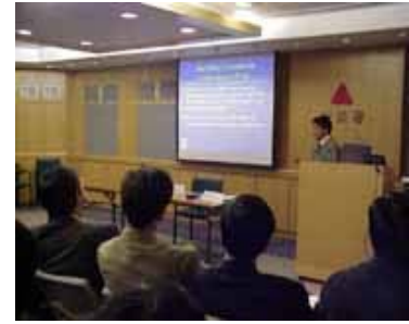
Regular in-house training course

The Hong Kong Quality Assurance Agency audits us twice per annum on the EMS and inspects our projects, sites and documentation to make sure that the system is effective in achieving our environmental goals. Through this system, we can continue to meet the growing expectations of our clients.