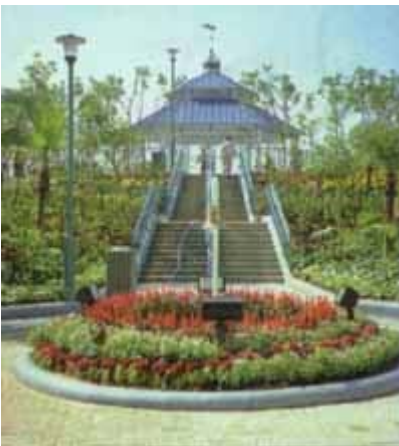
Belcher Bay Garden was presented the Gold Award (Overall Winner) of the 1998 Green Project Award Scheme in January 1999