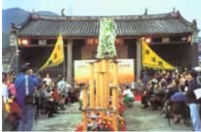
Restoration work for Tang's Chung Ling Ancestral Hall - Lung Yeuk Tau Heritage Trail in Fanling

The Restoration of Cheung's Ancestral Hall in Shan Ha Tsuen in Yuen Long is also recently completed.