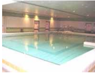
Use of heat pump to heat up hot water in hospital's hydrotherapy pool