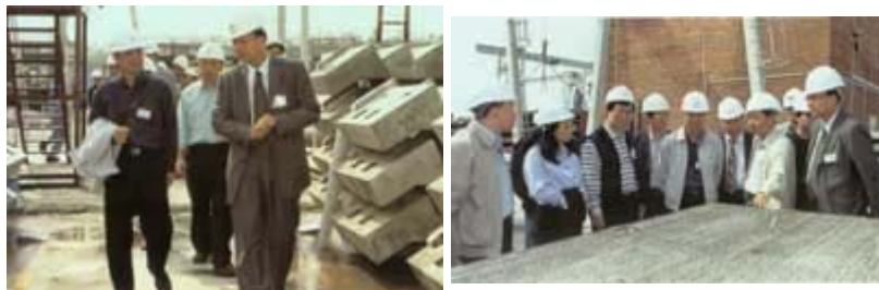
Visit to Precast Plant in Shenzhen