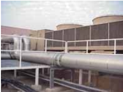
Use of heat recovery system to heat domestic water and reheat conditioned air