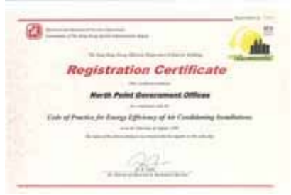
North Point Government Offices received 3 certificates for compliance with the "Codes of Practice for Energy Efficiency " of Electrical Installations , Lighting Installations and Air Conditioning Installations