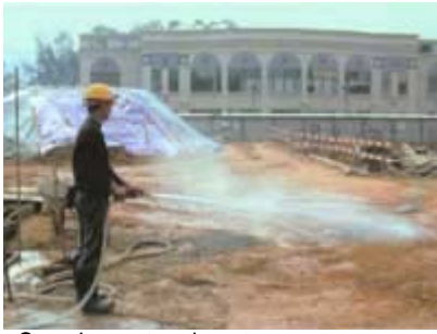
Spraying water along temporary access road to cut down construction dust