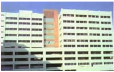
Headquarters Building of Property Services Branch , ArchSD received certificate for compliance with the "Code of Practice for Energy Efficiency" of Lighting Installation.