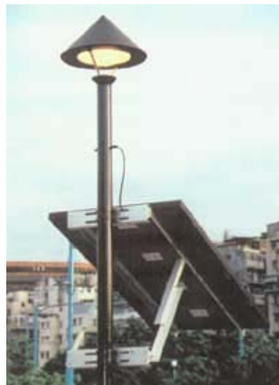
Use of photovoltaics for projects located in remote sites and for park lights in some open areas.