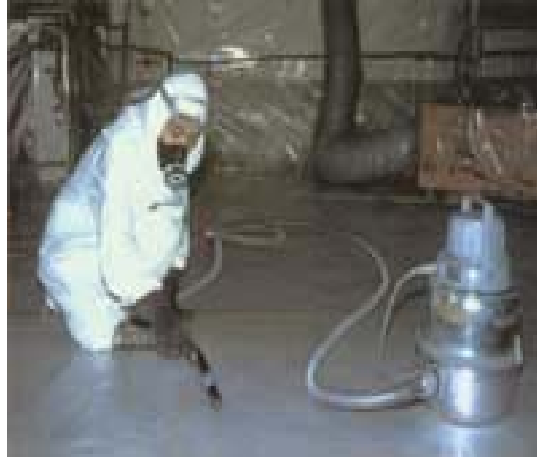
Vacuum cleaning asbestos materials

ArchSD is also responsible for the removal of asbestos containing materials (ACM) in existing government buildings. The numbers of buildings involved have substantially decreased after previous years of intensive removal works. The ACM not yet removed in the government buildings are classified as "low risk" and are under close monitoring.