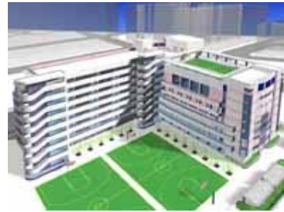
2000 design primary school - OTTV 11\text{W}/\text{m}^2

In 1999 , 93% of our projects achieved an OTTV of less than 23\text{W}/\text{m}^2 , exceeding the target of 90% by 3% . In 2000 , we aim to achieve OTTV of less than 18\text{W}/\text{m}^2 sq. for 10% of our projects .The current statutory OTTV requirement is 35\text{W}/\text{m}^2 .