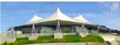
Museum of Coastal Defence

In 1999, 112 projects were completed. Annual expenditure totalled HK$10.8 billion. Through the inclusion of more environmentally friendly elements within projects such as Health Education and Exhibition Centre in Kowloon Park, Slaughter House in Sheung Shui, Museum of Coastal Defence in Lei Yue Mun, and the Award Winning Designs such as the Belcher Bay Garden, the "Hong Kong Garden" in the Kunming International Horticultural Exposition and the Swimming Pool Complex in Tai Po, we are gradually improving the environment of Hong Kong.