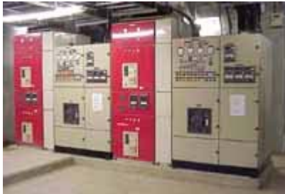
Pre-assembled electrical distribution board Target : 50% new projects

In 1999, 100% new projects used prefabricated joint for main water pipe, over 95% new projects used prefabricated air duct and pre-assembled electrical distribution board, and 82% new projects used prefabricated metal mounting brackets.