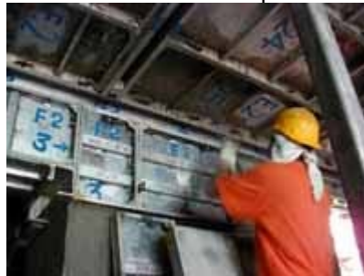
Use of aluminium formwork to replace conventional timber formwork