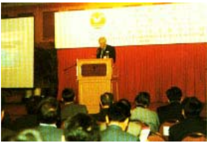
ArchSD representative briefed the construction industry of the Department's environmental policy

ArchSD participated in 30 publicity functions in 1999 including seminars, conferences, workshops, ceremonies and exhibitions etc. We have promoted our Environmental Policy among the industry and general public through the ArchSD homepage, interviews, feature articles, publication and participation in the Hong Kong Institute of Architects Committee of Sustainable Development.