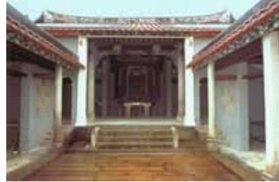
Cheung's Ancestral Hall (after restoration) in Shan Ha Tsuen, Yuen Long