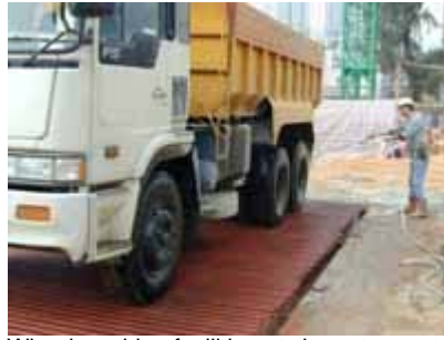
Wheel washing facilities at site entrance to eliminate dust being carried to public road