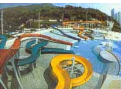
Tai Po Swimming Pool Complex won a Special Distinction Award from the International Olympic Committee and the International Association for Sports and Leisure Facilities in 1999