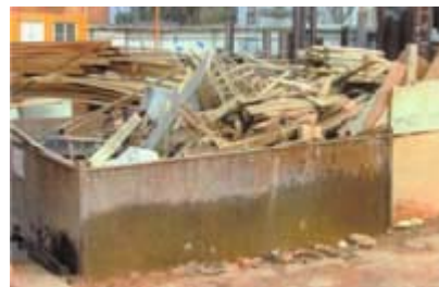
Metal, timber, packaging materials, bamboo scaffoldings