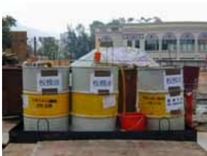
Proper containment of hazardous materials to avoid contamination

To ensure that our contractors are in compliance with the environmental legislations, a "Site Aspects Schedule" (SAS) identifying the significant environmental aspects during construction has to be prepared at the commencement of construction . The SAS would be recorded in the site record book, reported during site meetings and eventually reflected in the Contractor's Performance Report. To help contractors we have prepared information for them to follow.