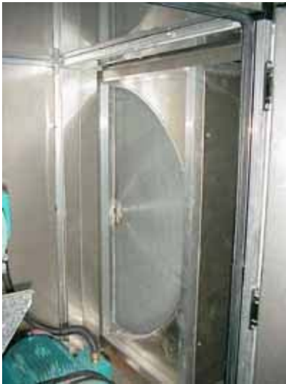
Use of heat wheel to reclaim thermal energy from exhaust air to treat incoming fresh air