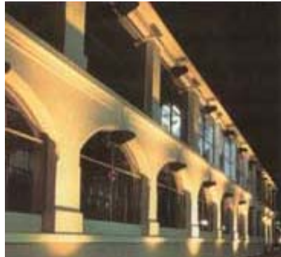
Refurbishment of the old barrack block in Kowloon Park

The ArchSD Annual Award Winner "Health Education and Exhibition Centre" is designed from an existing old barrack block located at the entrance of the Kowloon Park and has incorporated new features.