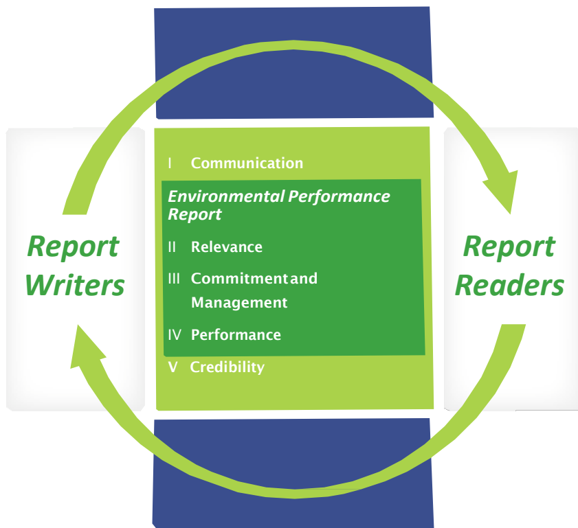
Structure of “A Benchmark for Environmental Performance Reports”

The structure of the EPR Benchmark, the overview of the 20 criteria and the description and weighting of each criterion group are provided as follows: