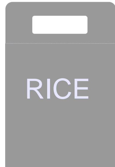
A bag of rice

Plastic shopping bags excluded from the levy scheme