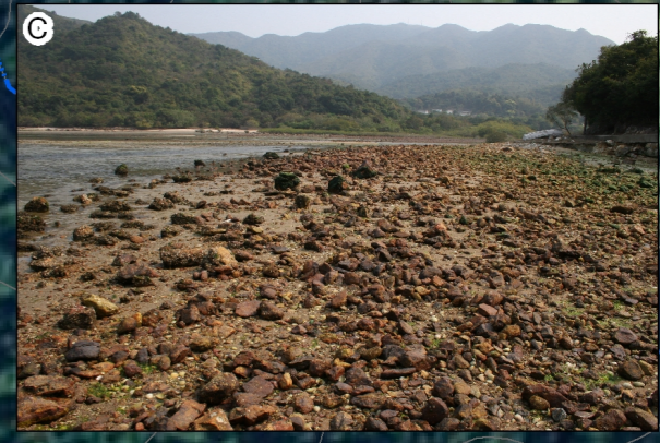
Transect Locations for Quantitative Survey at Lai Chi Chong