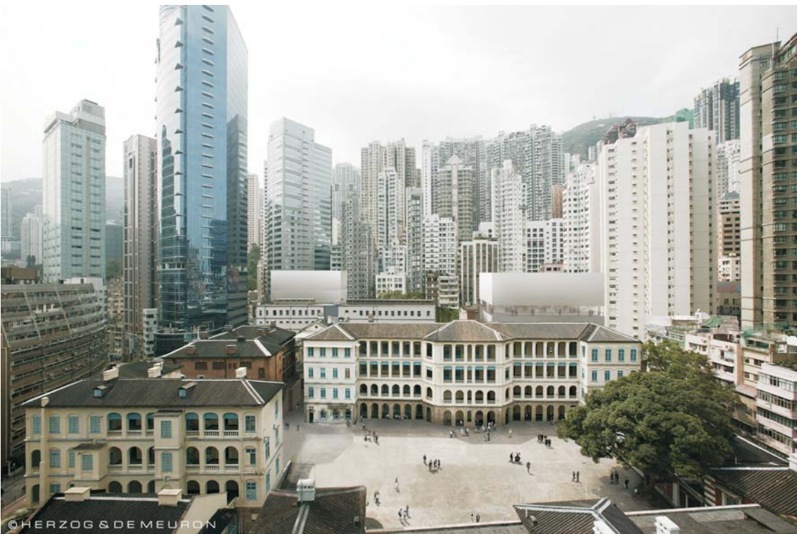
View towards Project Site without Mitigation Measures on Day 1 of Operation