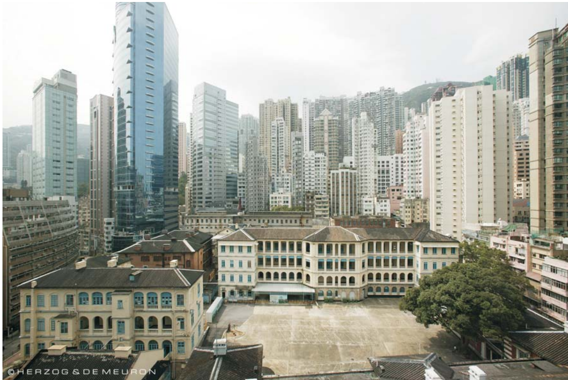
Existing view towards Project Site