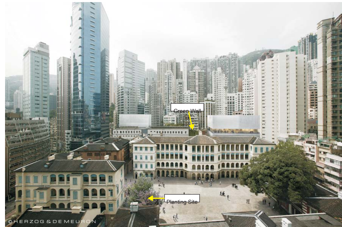
View towards Project Site with Mitigation Measures at Year 10 of Operation*

Photomontage from VPb (Medium/ High Level Commercial/Residential Building(s) above Hollywood Road)