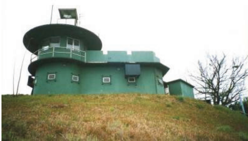
General view from another angle