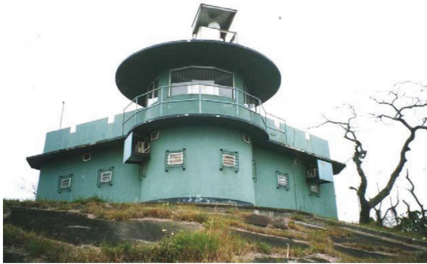
General front view