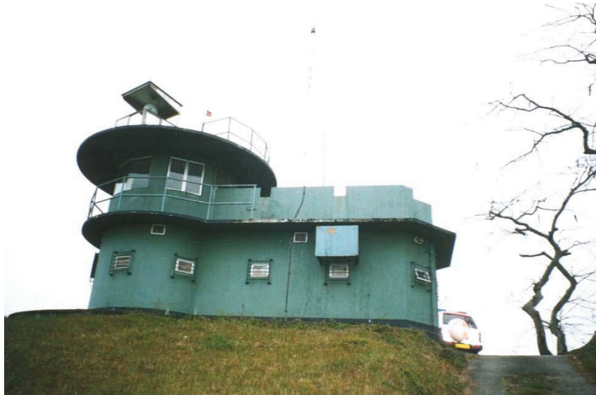
Right elevation