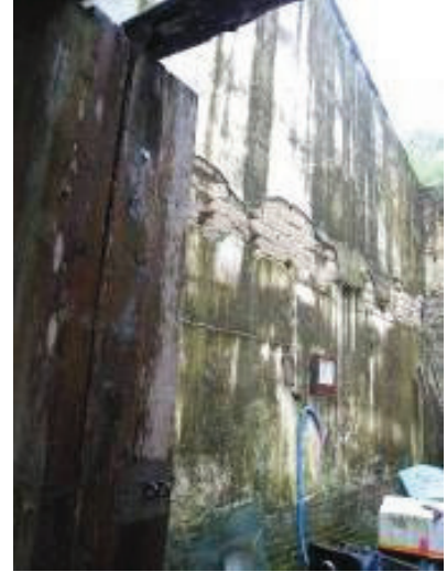
North Side Wall (Left) and East Side Wall (Right)