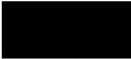
Full Name in Block Letters