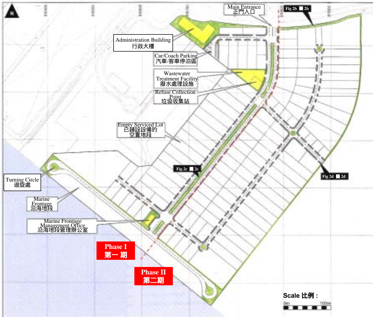
Figure 2a: Conceptual Internal Layout – Landscaping and Infrastructure 圖2a：內部概念圖 – 景觀與基礎設施