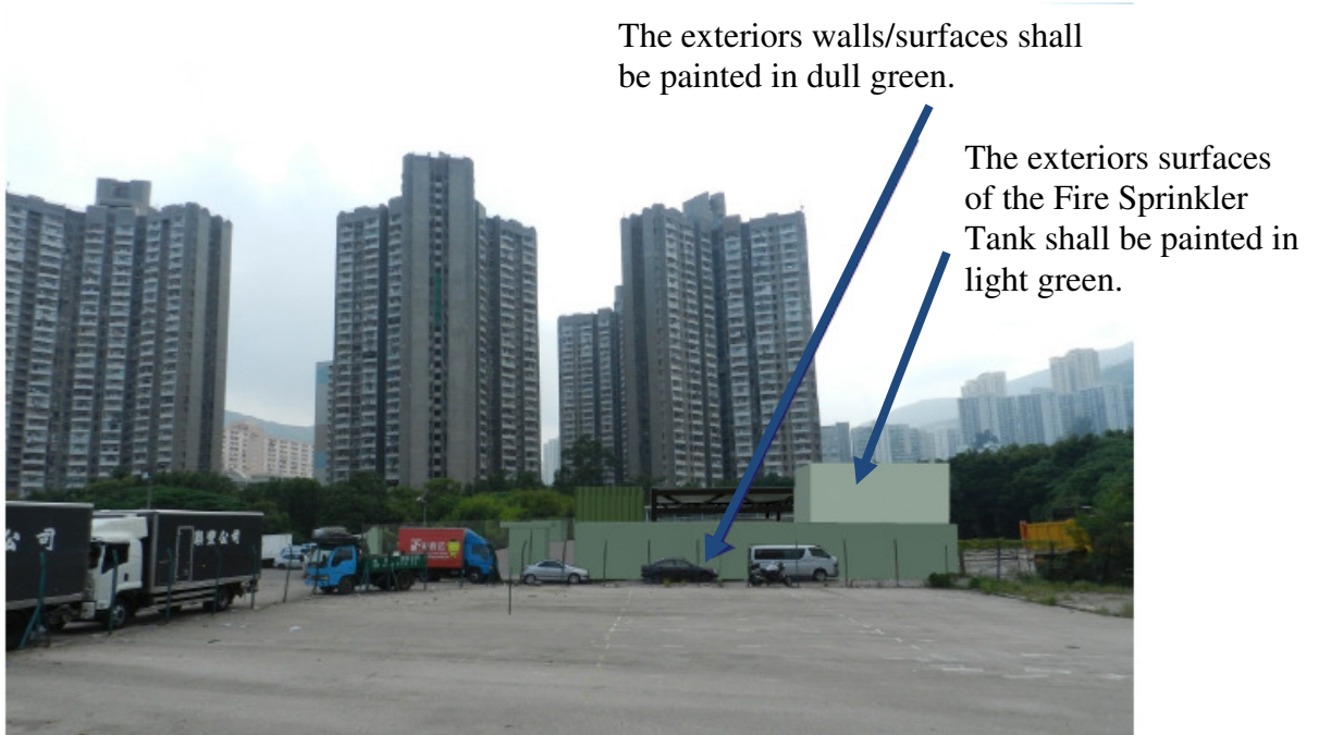
Side View of the painted exteriors walls/surfaces