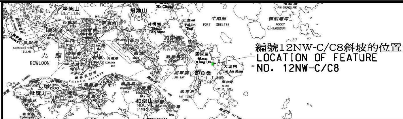
編號12NW-C/C8斜坡的位置 LOCATION OF FEATURE NO. 12NW-C/C8