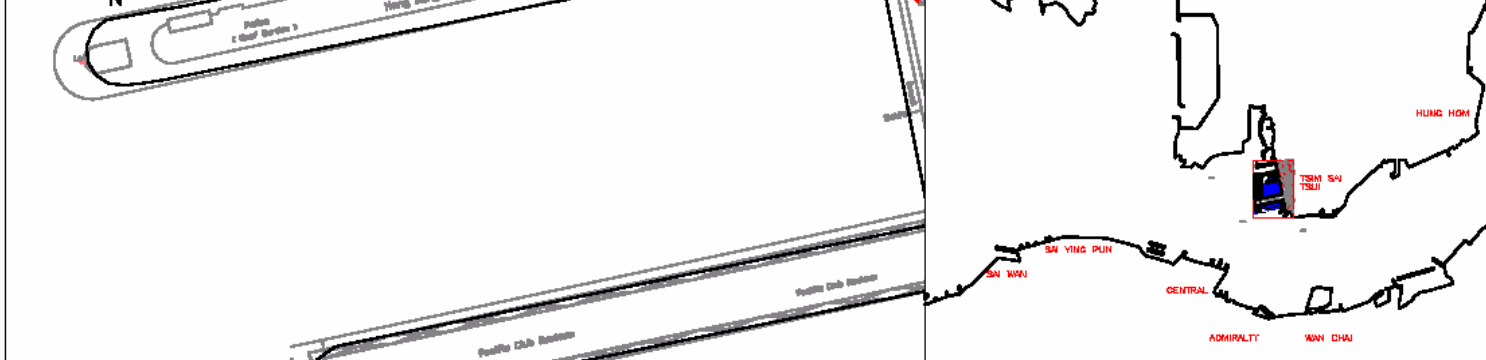
LAYOUT PLAN 1 : 100 000