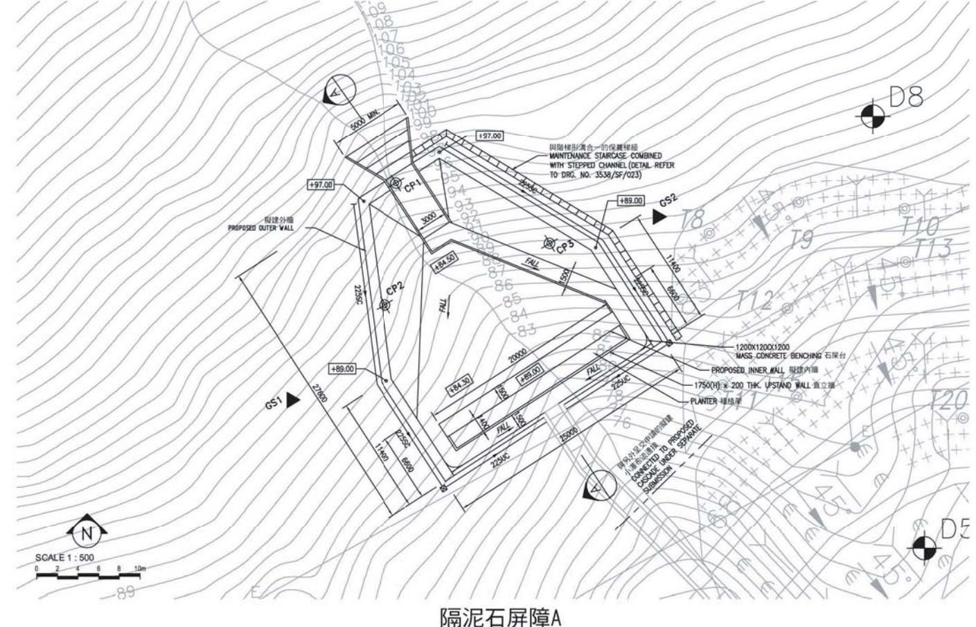
隔泥石屏障A DEBRIS - RESISTING BARRIER "A"