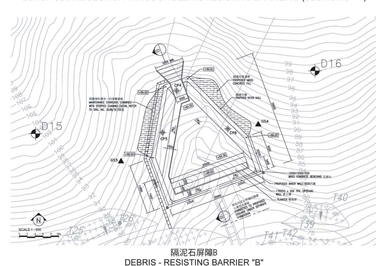
建議說明 Proposal Description