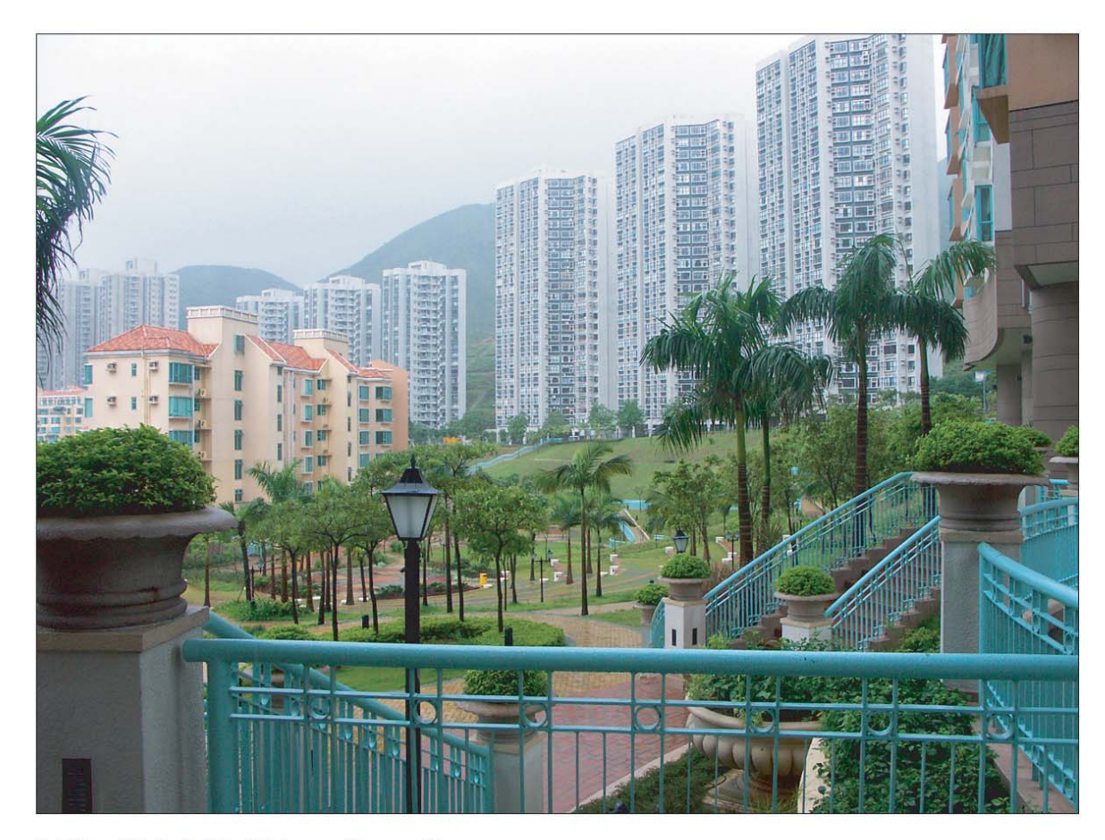
LR5 都市空間 Urban Open Space