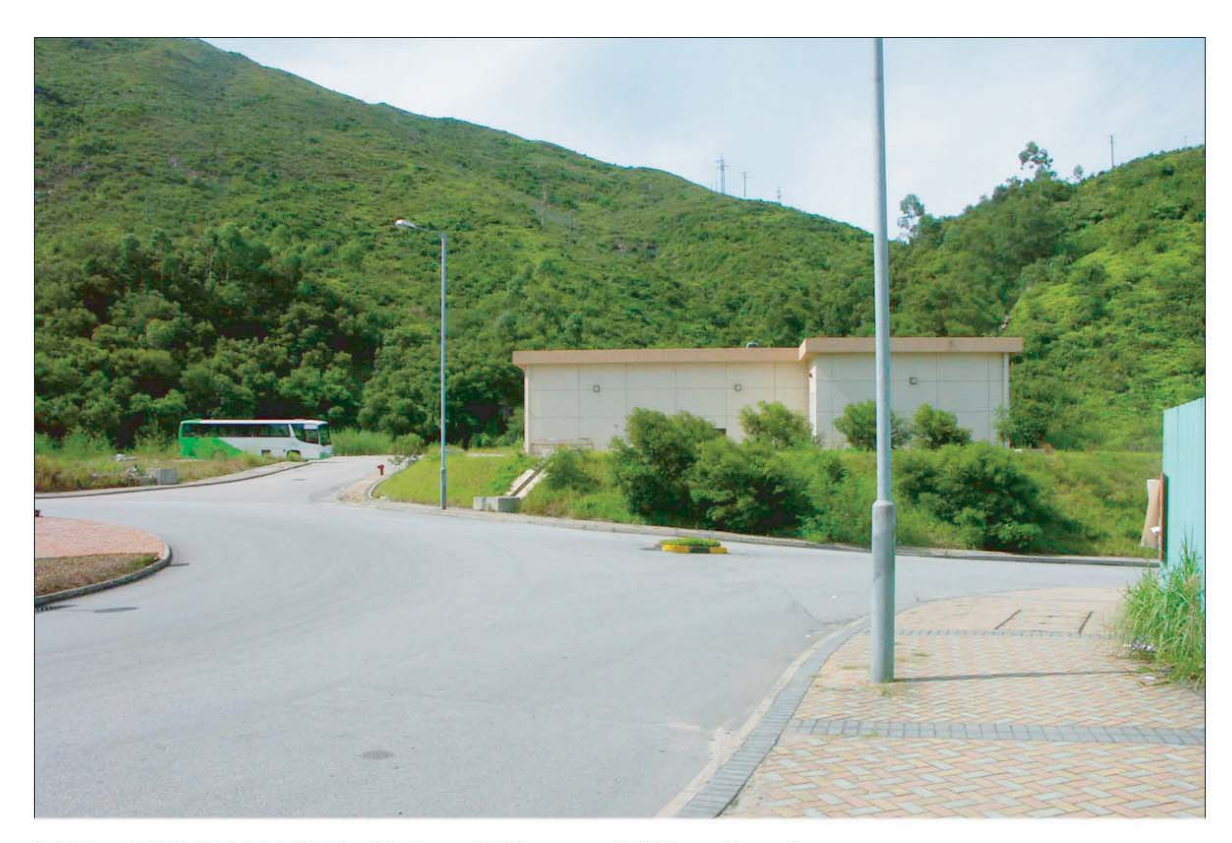
LR1 天然斜坡及林地 Natural Slopes & Woodland