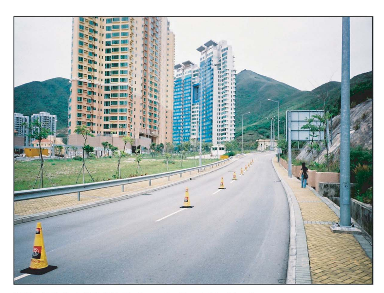
LR2 美化市容的路邊植樹 Amenity Roadside Planting