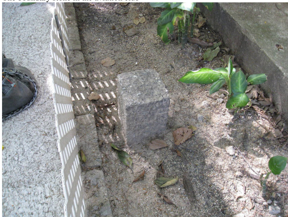
The boundary stone in the aviation club