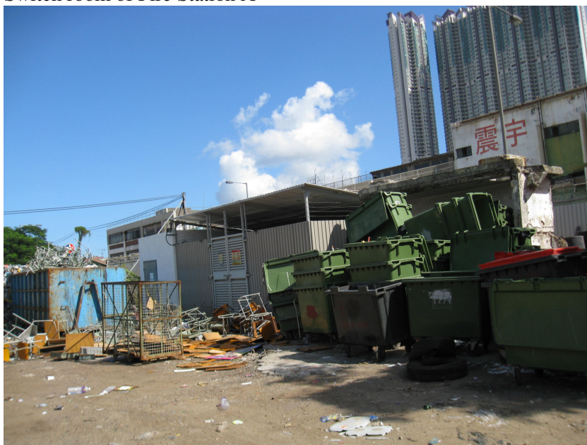
Switch room of Fire Station A