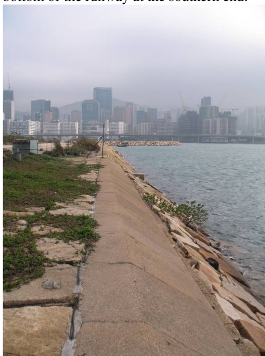
S1: Section of seawall running across the bottom of the runway at the southern end.