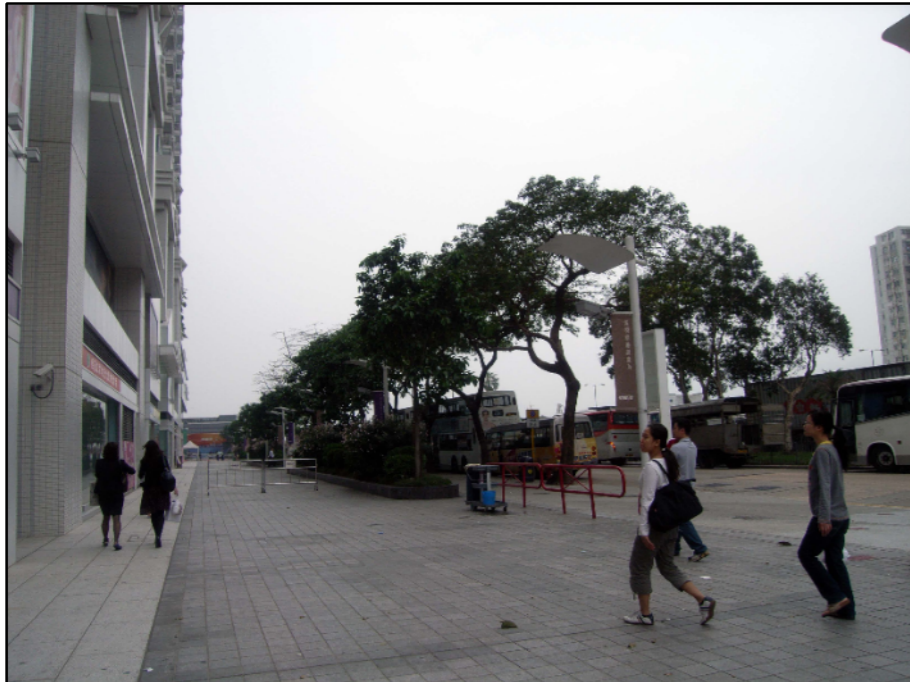
PHOTO A25 - LR25 TREES NEAR GRAND WATERFRONT