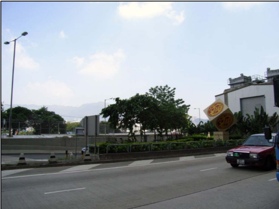
PHOTO A26 - LR19 TREES IN AMENITY AREAS ALONG SUNG WONG TOI ROAD