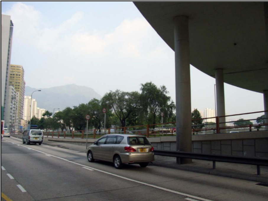
PHOTO A30 - LR23 TREES IN AMENITY AREAS OF SAN PO KONG INTERCHANGE