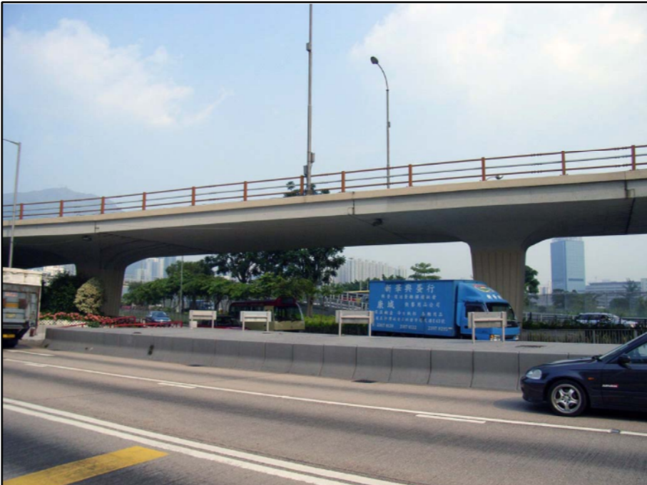
PHOTO A29 - LR23 TREES IN AMENITY AREAS OF SAN PO KONG INTERCHANGE