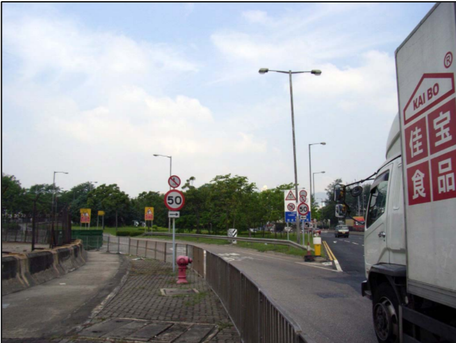
PHOTO A27 - LR22 TRESS IN AMENITY AREAS NEAR THE INTERCHANGE IN KOWLOON BAY