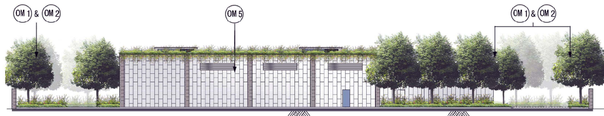
SECTION SCALE 1:250