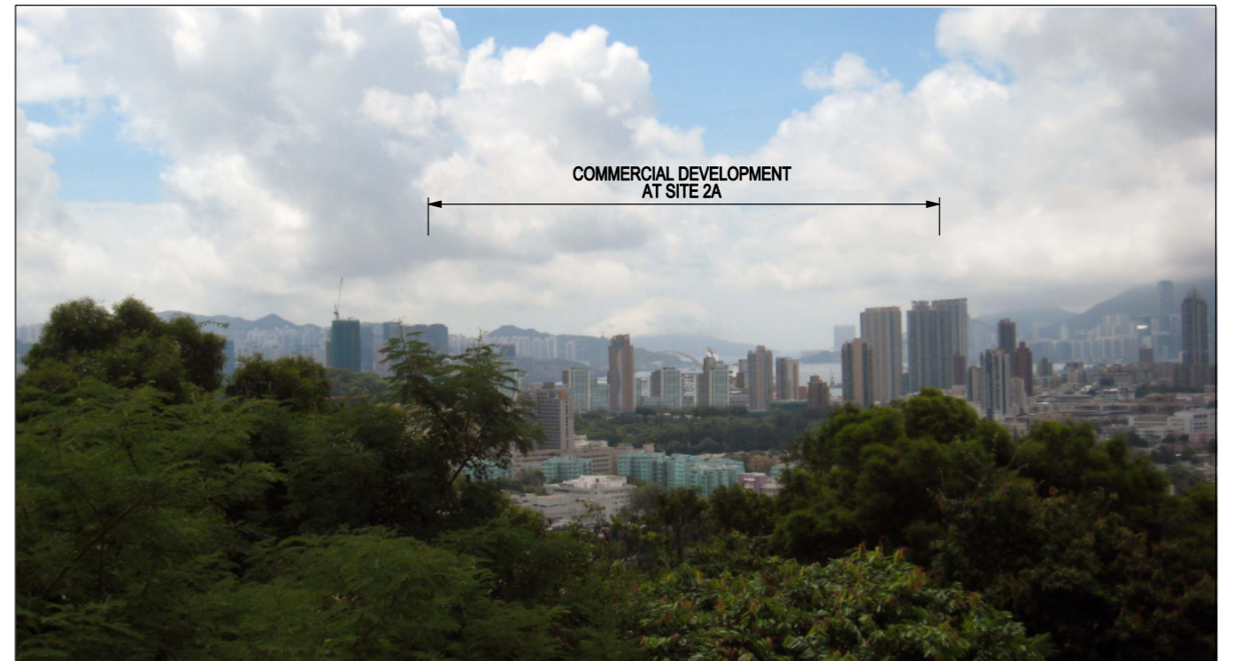
10 YEARS WITH MITIGATION MEASURES