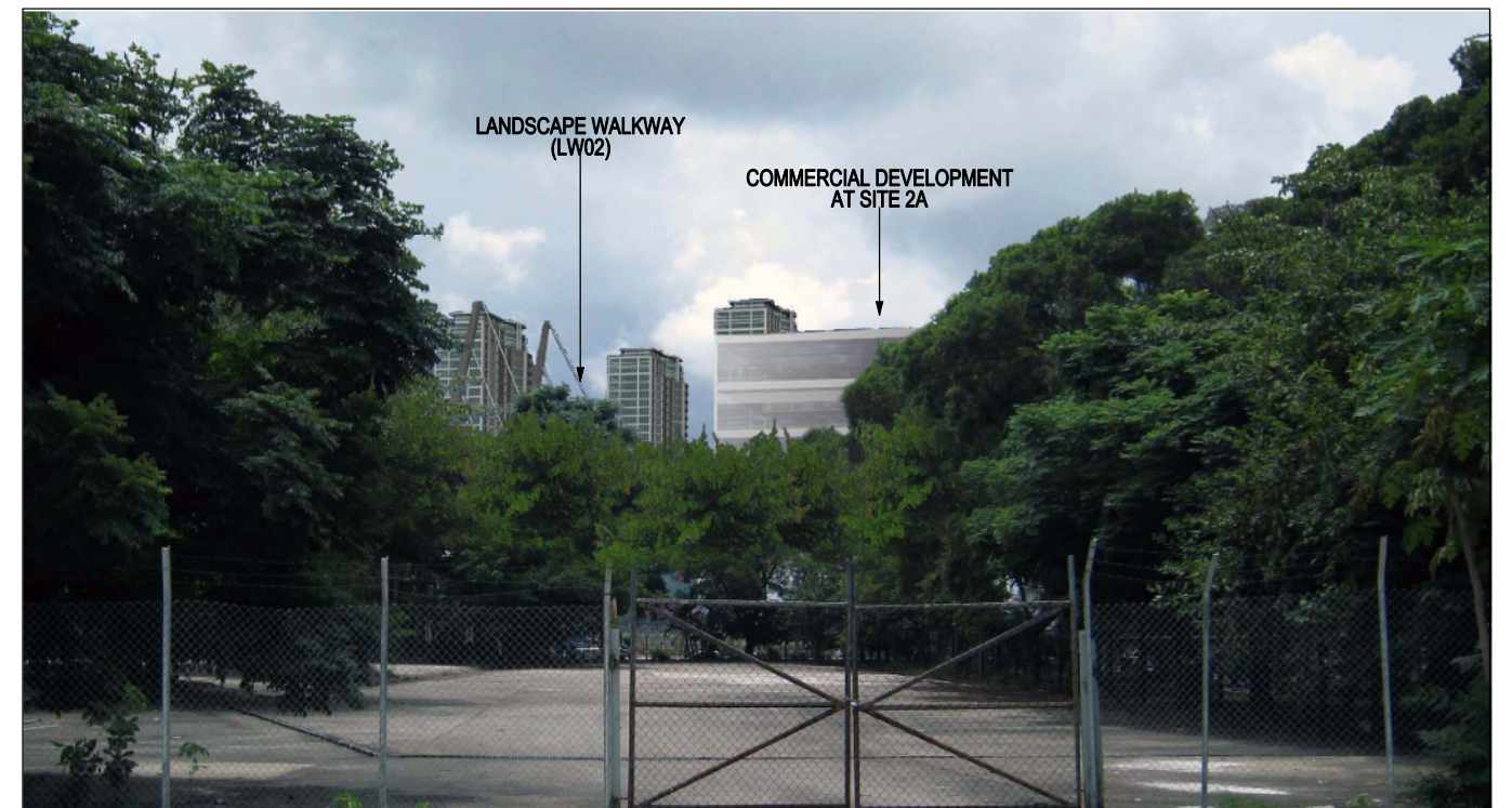
10 YEARS WITH MITIGATION MEASURES