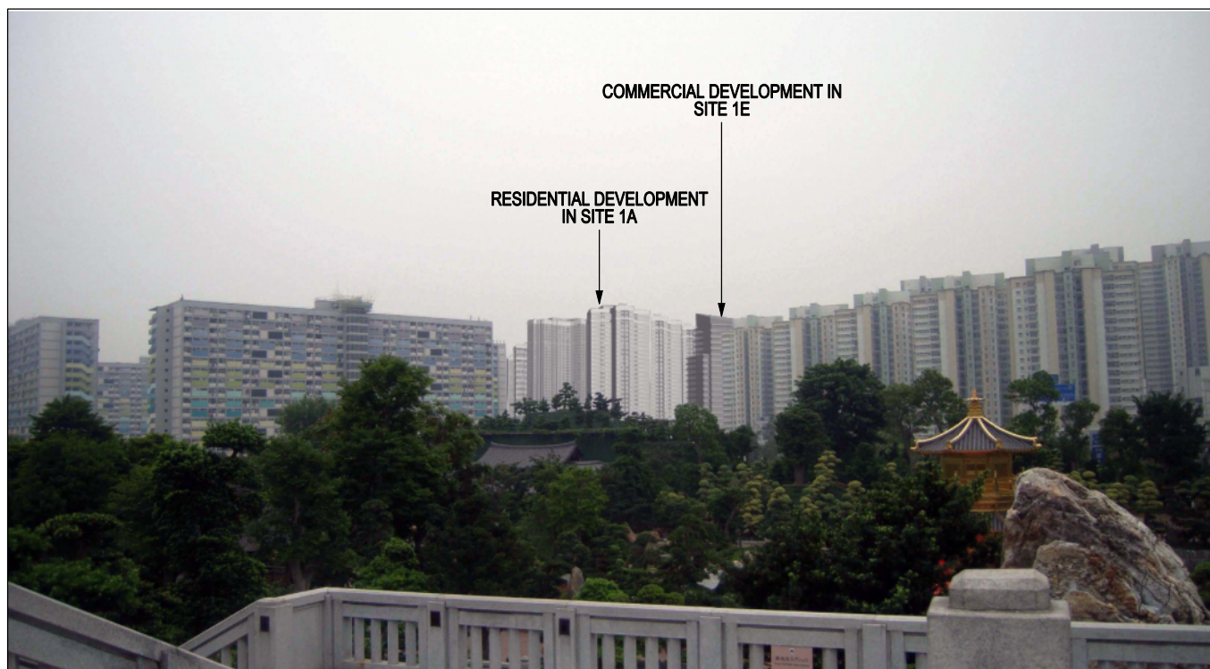
DAY 1 WITHOUT MITIGATION MEASURES