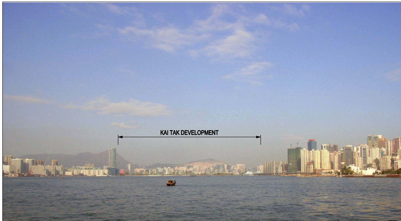
DAY 1 WITHOUT MITIGATION MEASURES