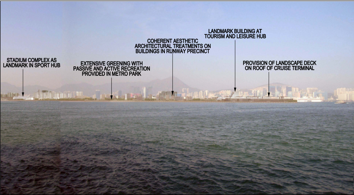
10 YEARS WITH MITIGATION MEASURES