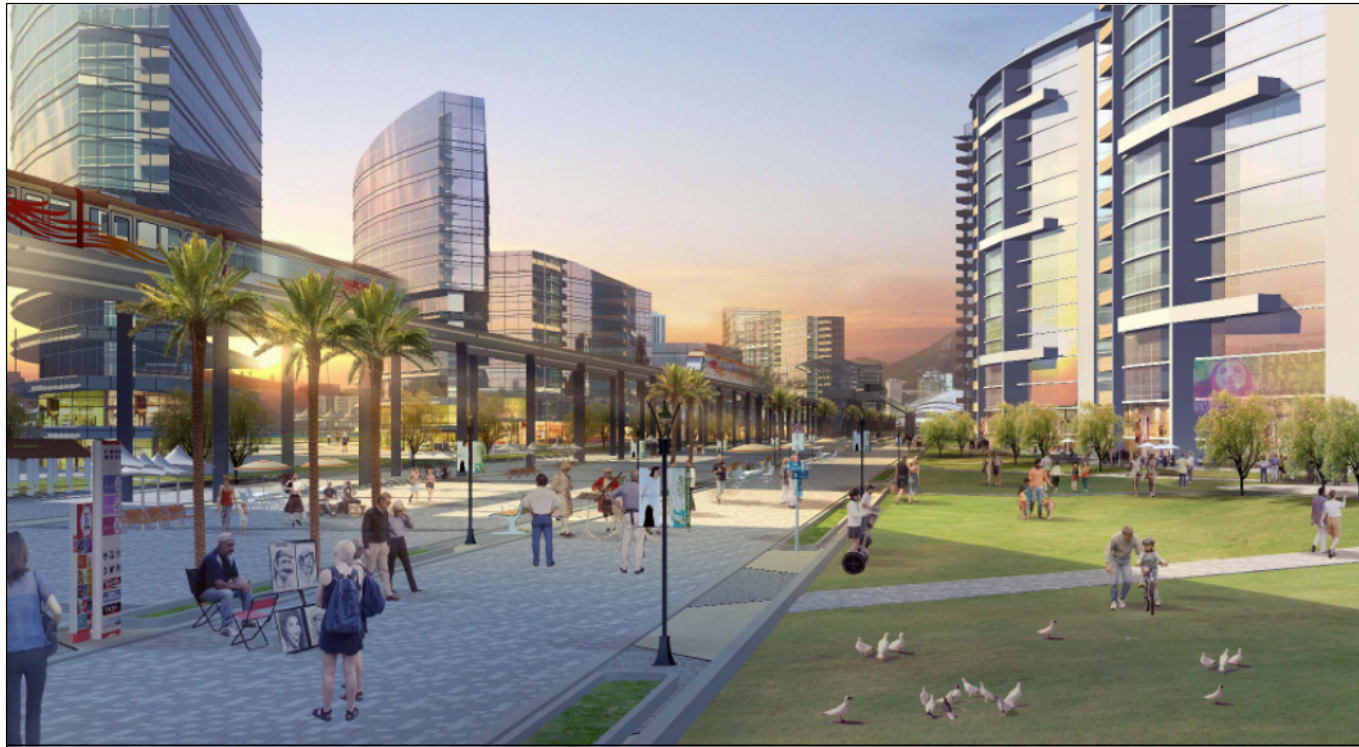
VIEWPOINT 5 - RUNWAY PRECINCT