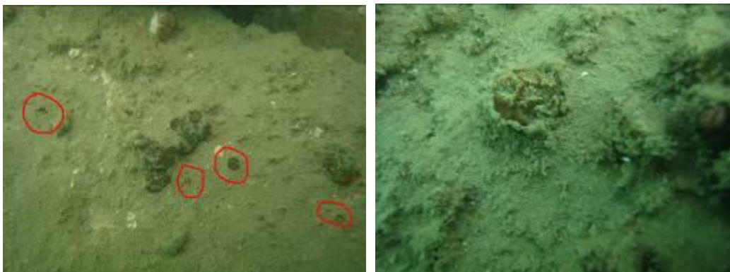
Photo 3 Layer of sediment covering on colonies of Oulastrea crispata